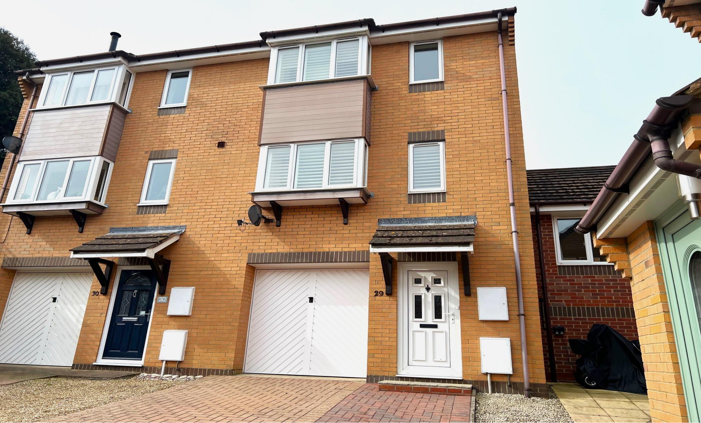
St Michaels Court, Faircross Avenue, Weymouth, DT4 0DS