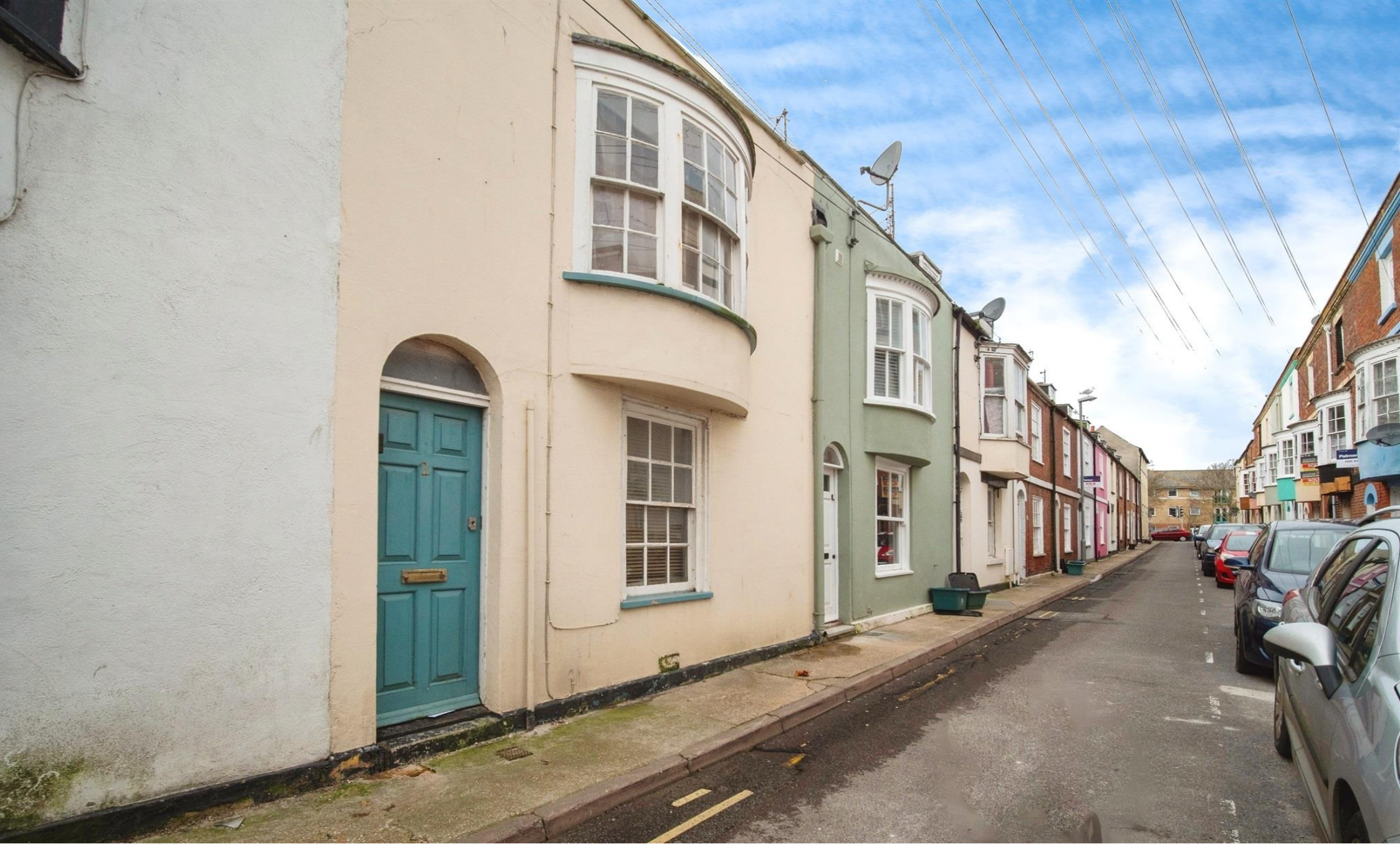
Bath Street, Weymouth, DT4 7DS