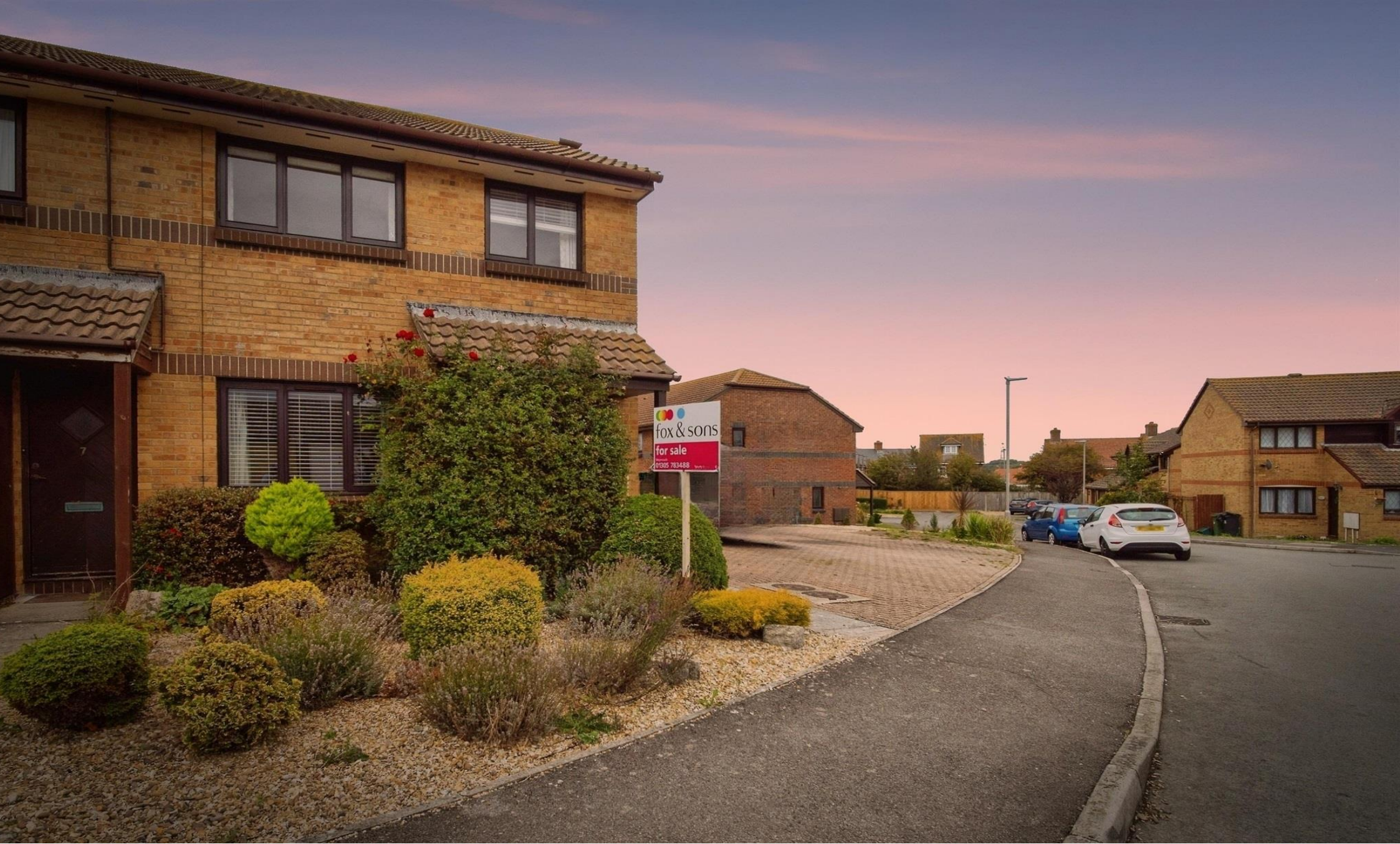
The Bindells, Chickerell, Weymouth, DT3 4BF