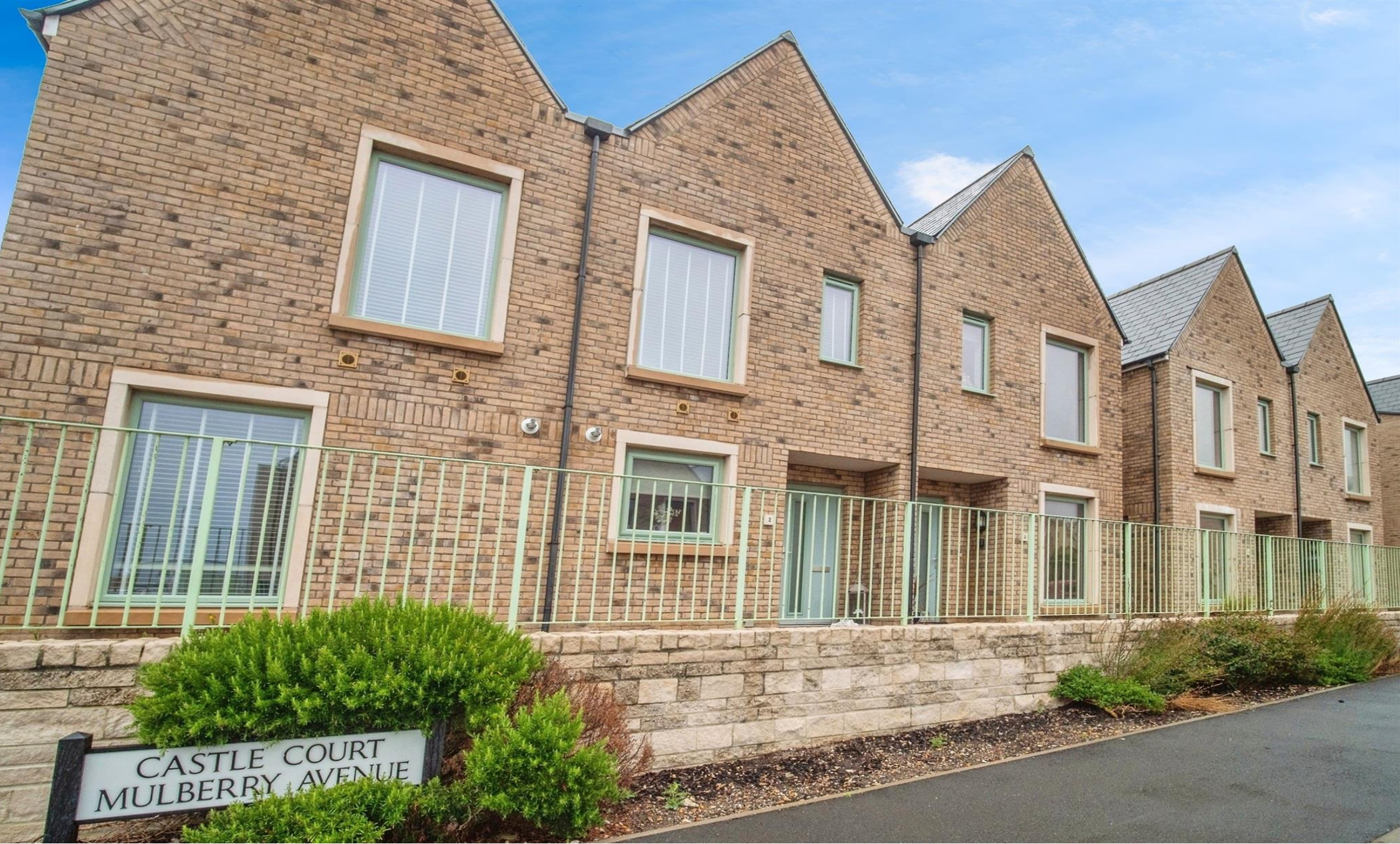
Castle Court, Mulberry Avenue, Portland, DT5 1FT