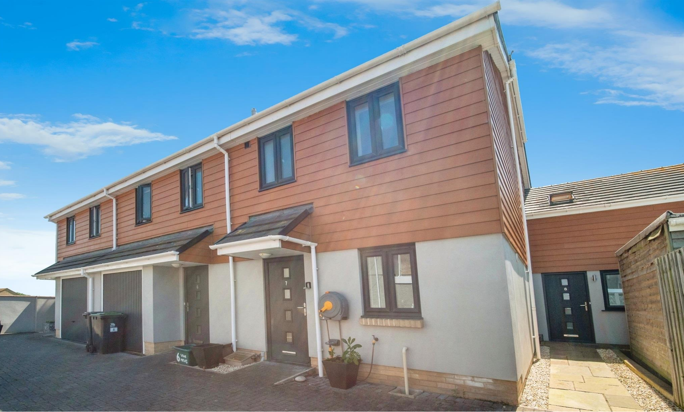
Vine Mews, Abbotsbury Road, Weymouth, DT4 0AQ