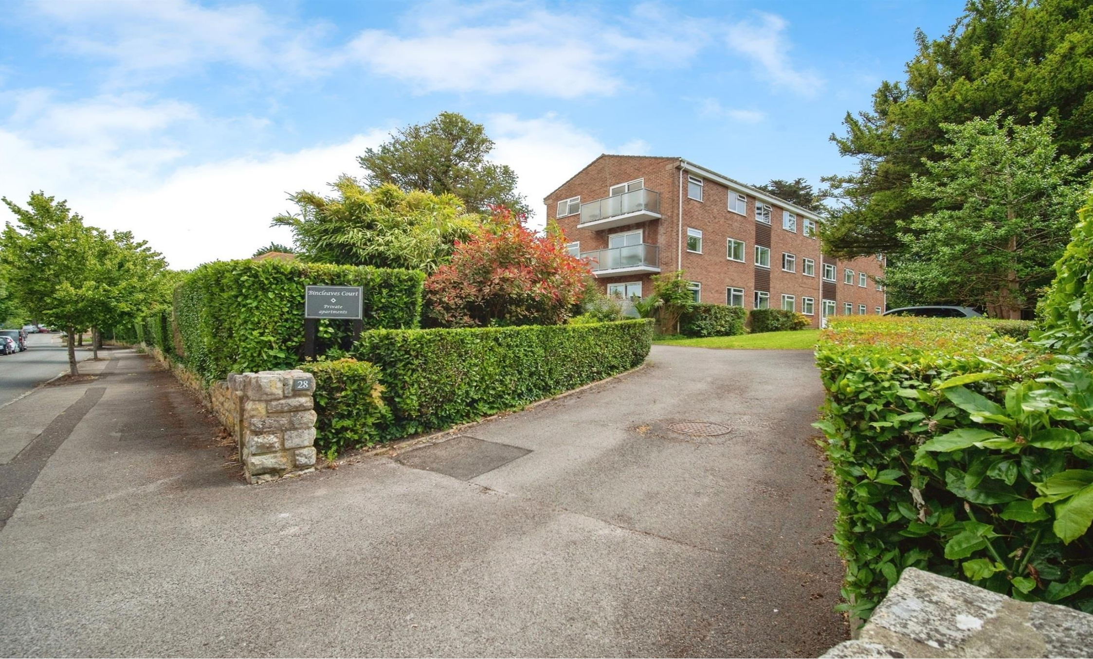
Bingleaves Court, Bingleaves Road, Weymouth, DT4 8RL