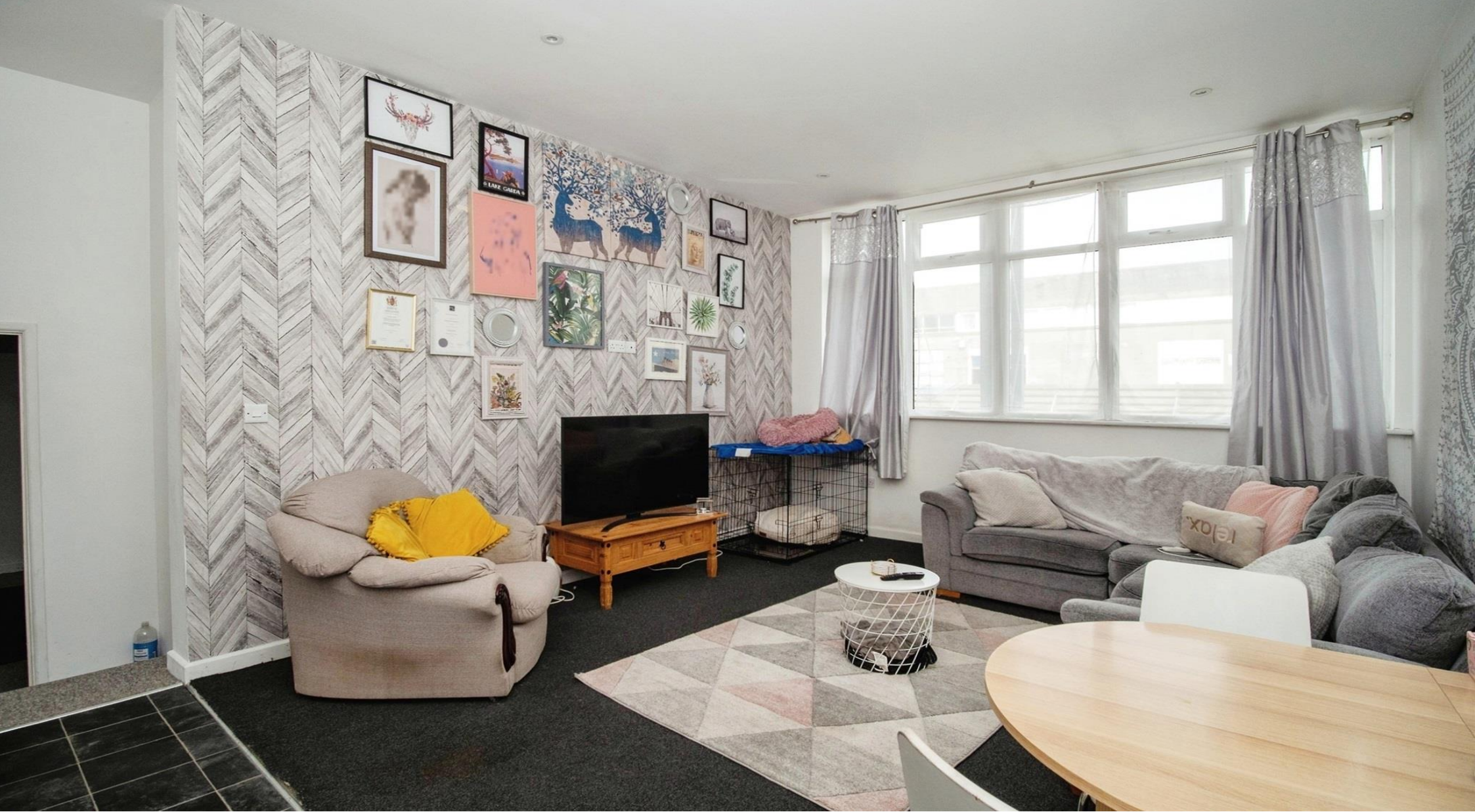
Espionage Place, South Way, Southwell Business Park, Portland, DT5 2FF

Not for marketing purposes INTERNAL USE ONLY