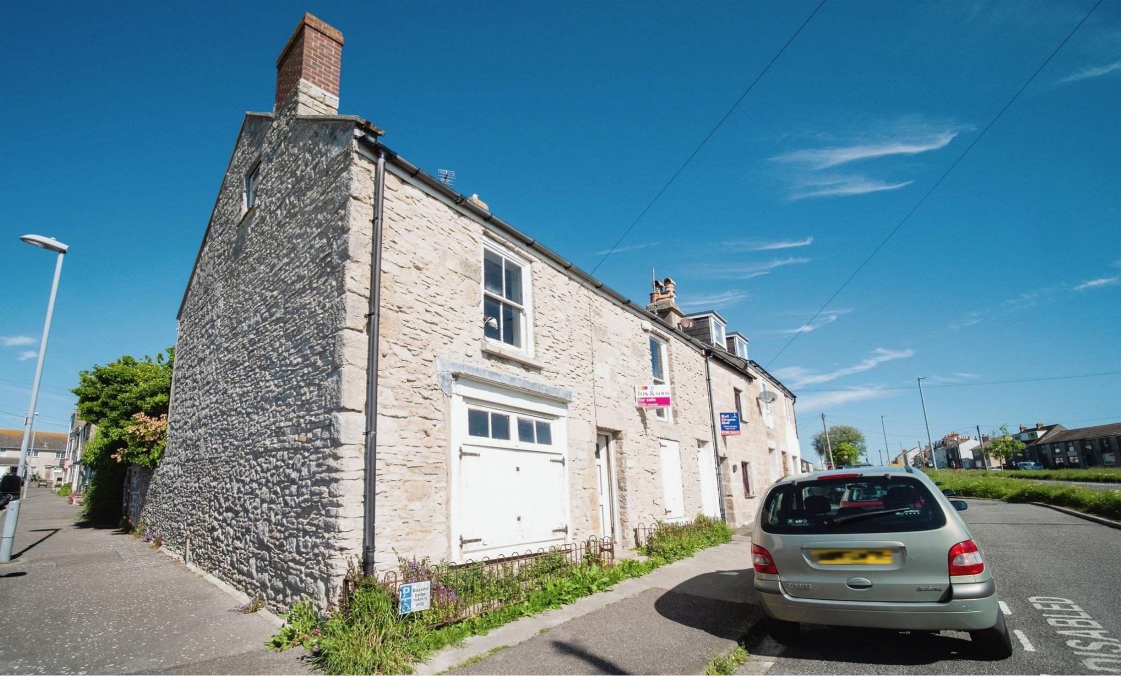
Weston Road, Portland, DT5 2BZ