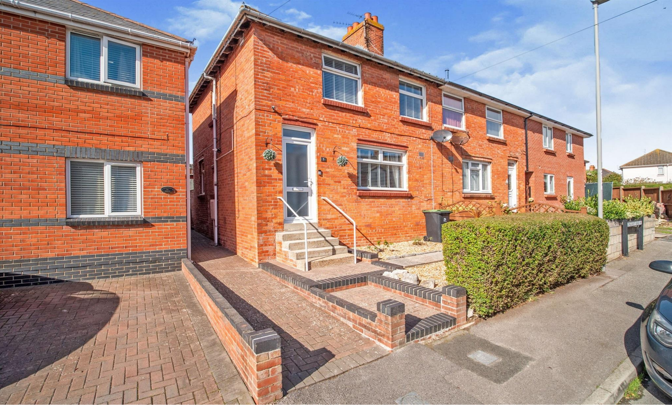
Longcroft Road, Weymouth, DT4 0NX