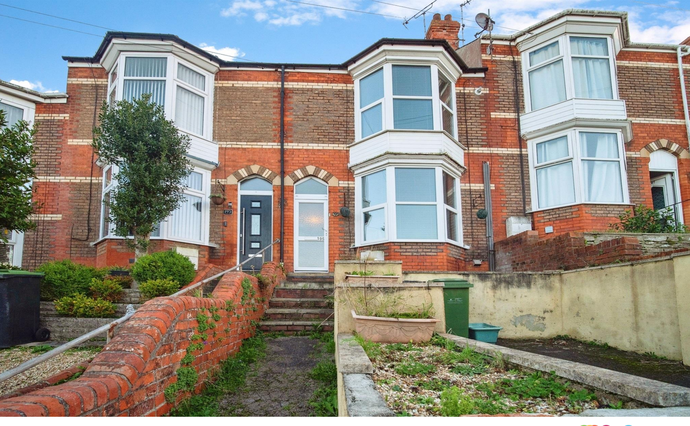
Chickerell Road, Weymouth, DT4 0BP