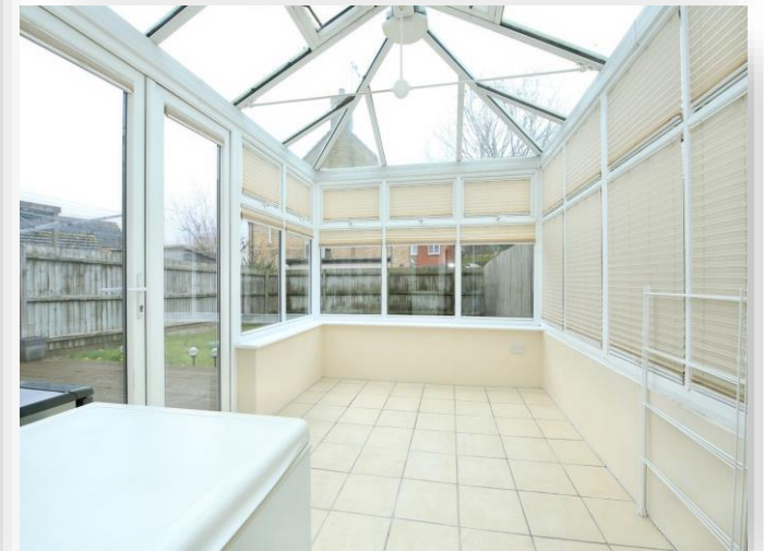
Ashbeach Drove, Ramsey Huntingdon PE26 2TG