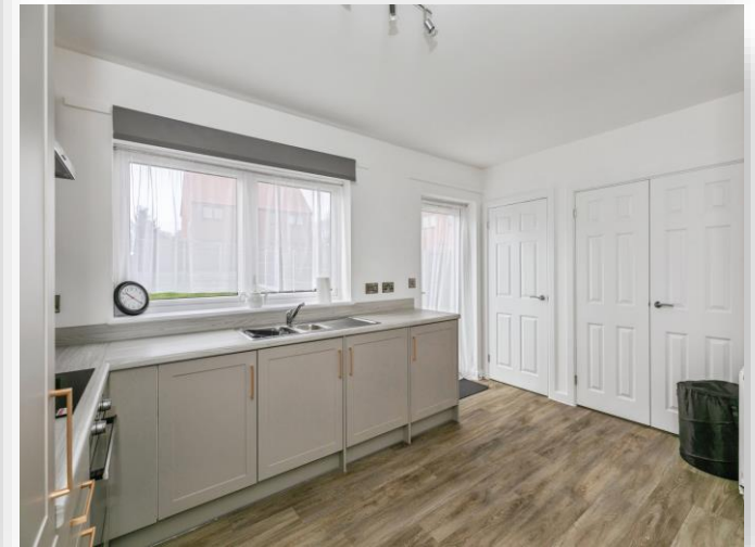
Rays Close, Ramsey Huntingdon PE26 2LF