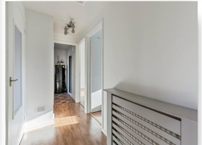
Serjeants Close, Ramsey Huntingdon PE26 1BL