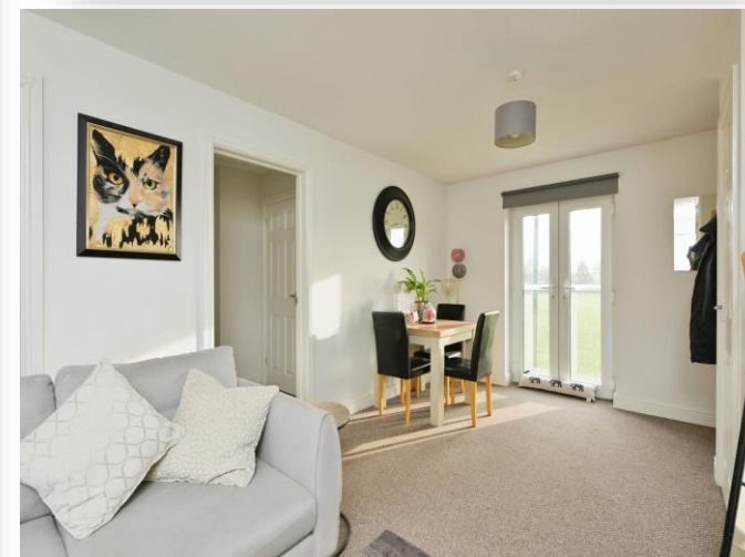
Banbury Apartments Cricketfield Lane, Ramsey Huntingdon PE26 1FE