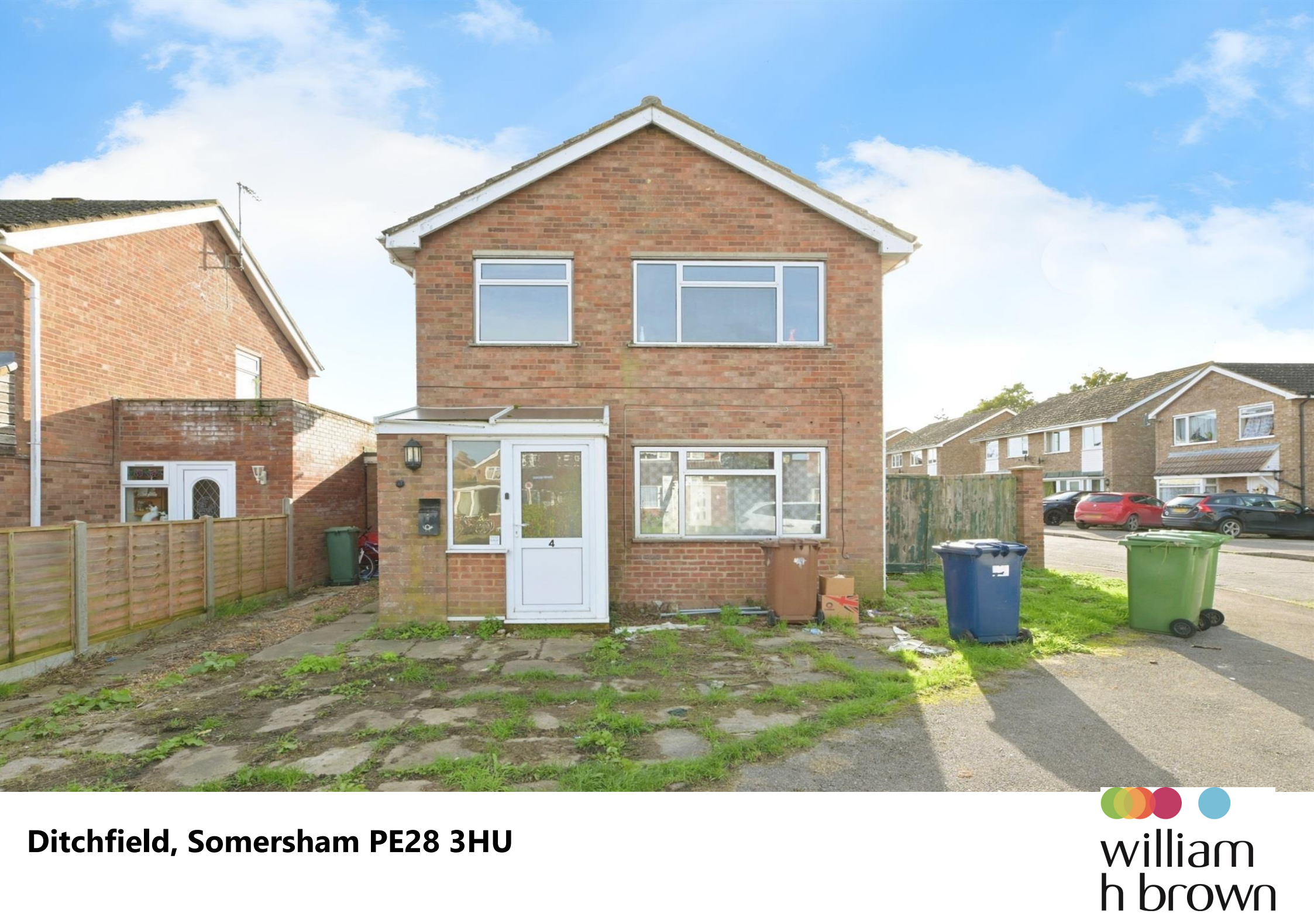
Ditchfield, Somersham PE28 3HU