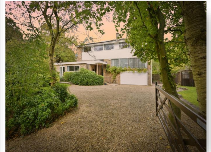
House In The Wood Hollow Lane, Ramsey HUNTINGDON PE26 1DQ