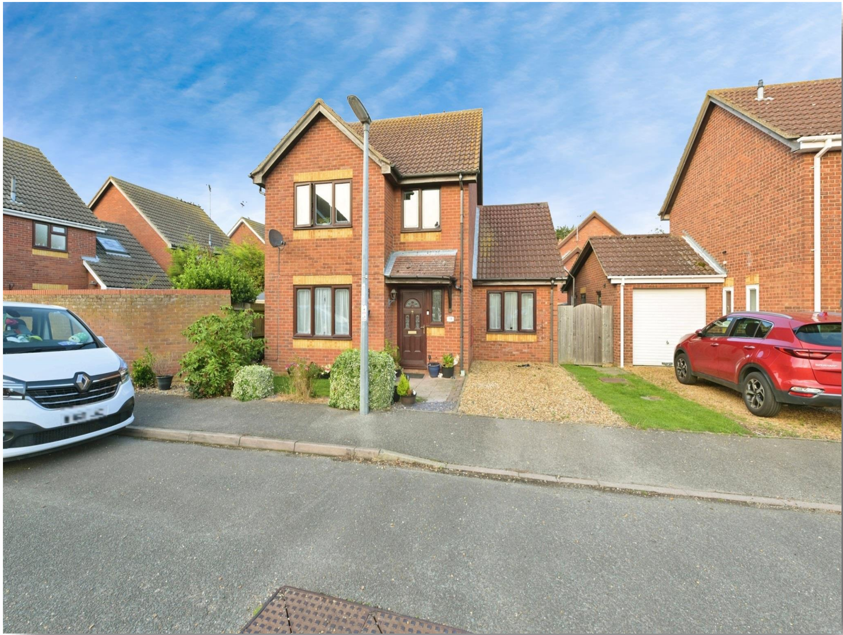
Chandlers Way, Ramsey Mereside PE26 2UJ