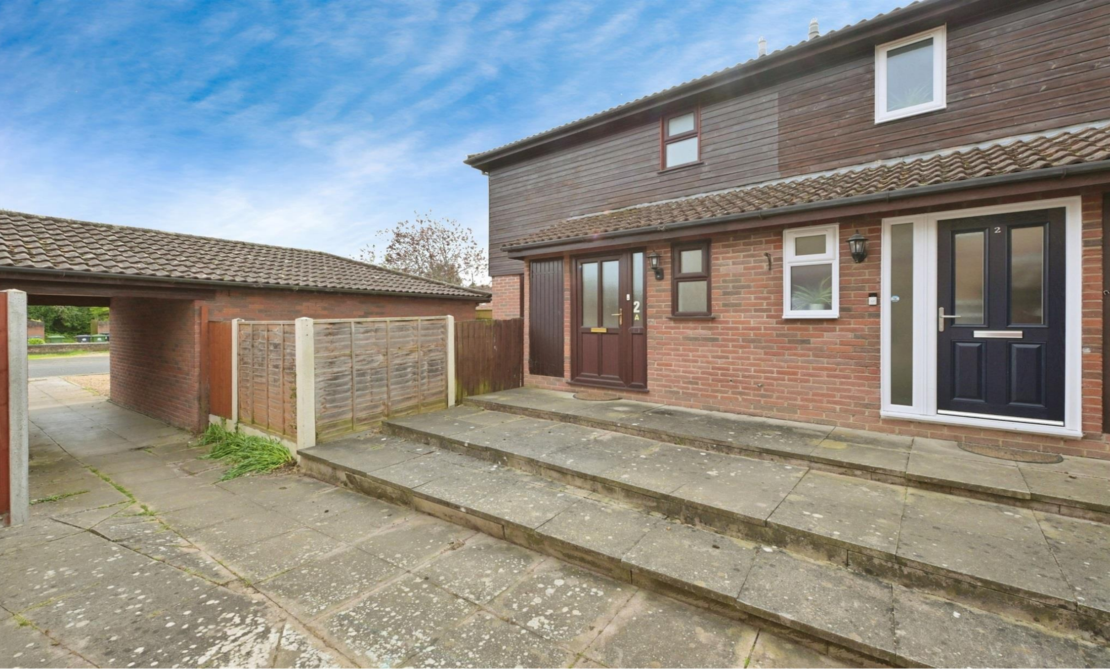
Fairfields Drive, Ramsey Huntingdon PE26 1BT