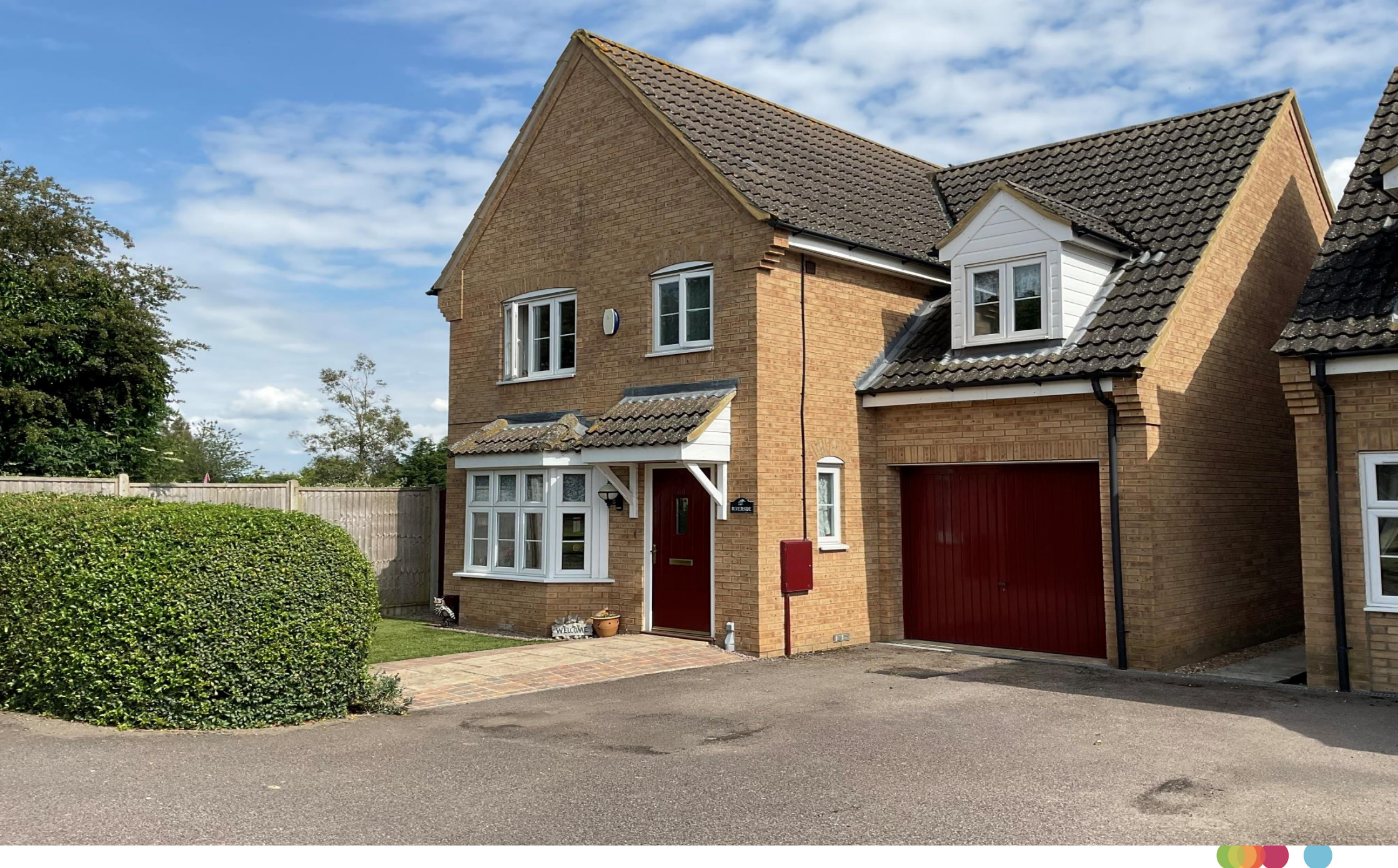
Heron Way, Benwick March PE15 0UA