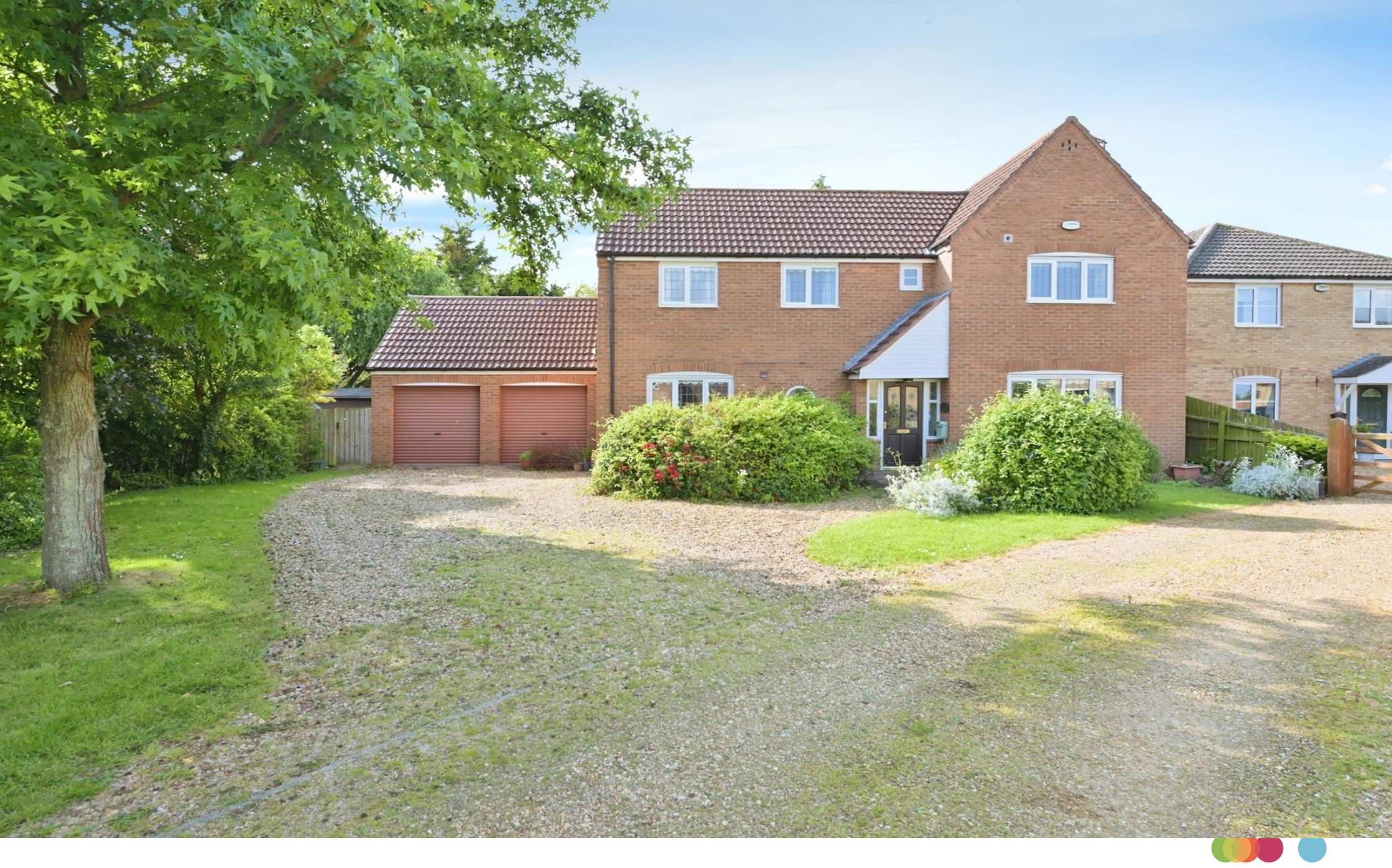
Field View, Ramsey Huntingdon PE26 2UL