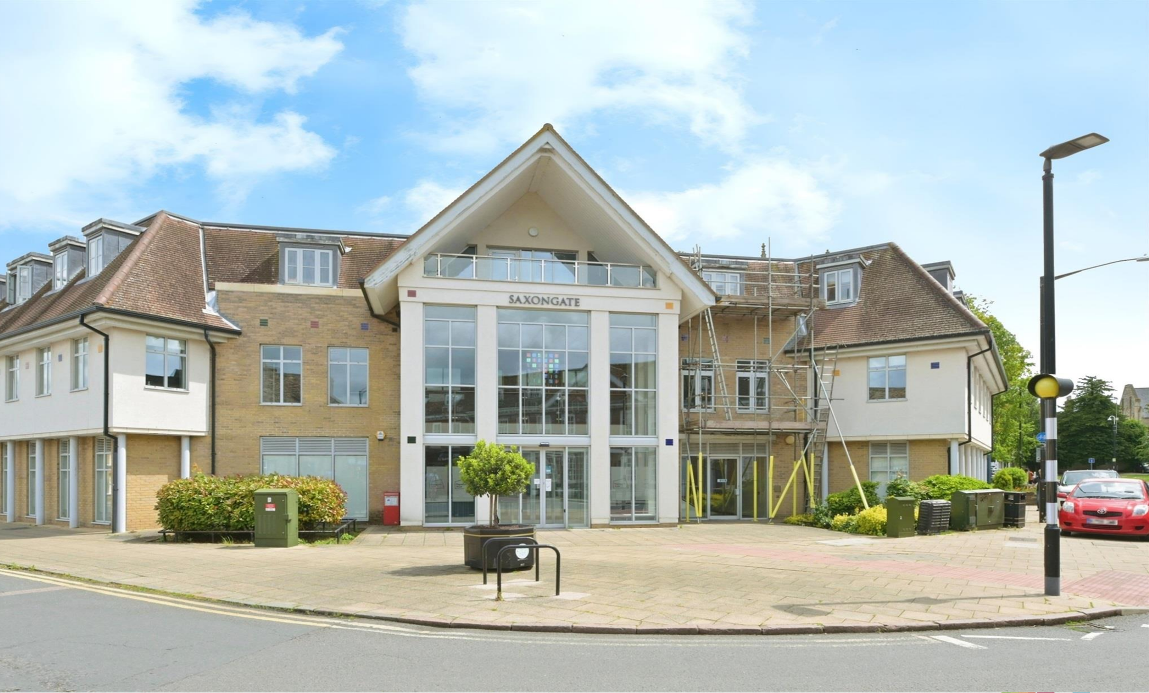
Saxongate Community Learning Centre Bradbury Place, HUNTINGDON PE29 3RR