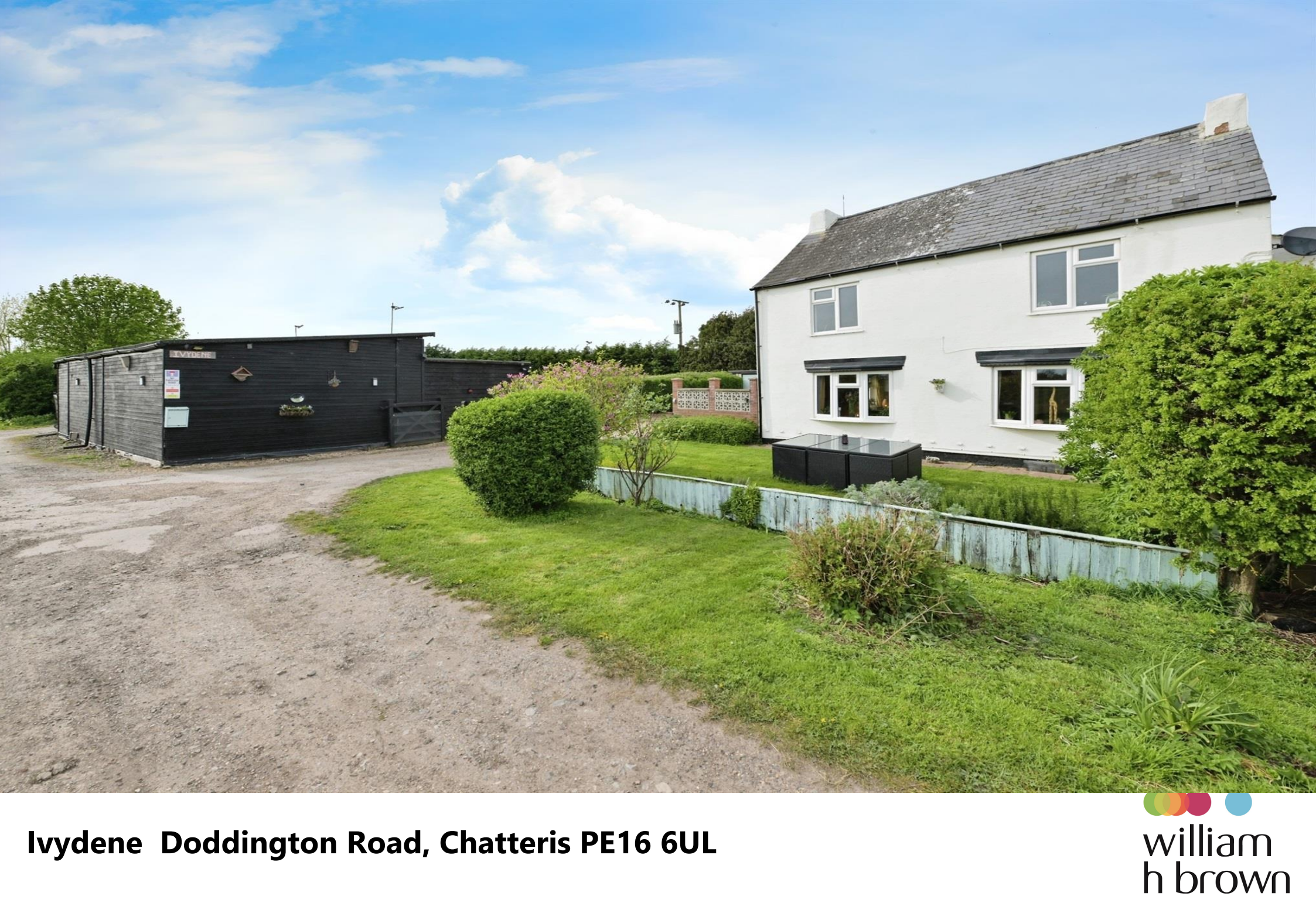
Ivydene Doddington Road, Chatteris PE16 6UL