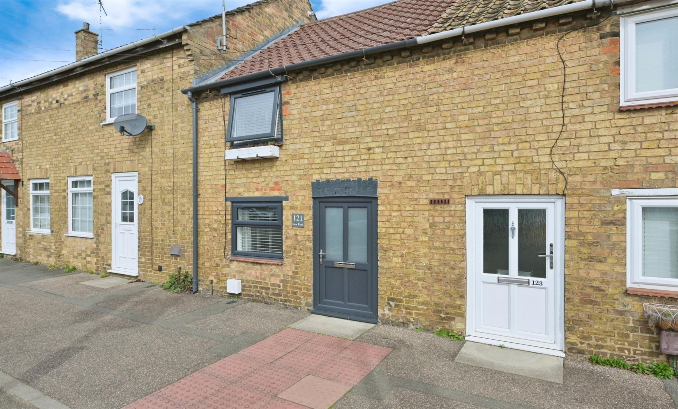
New Road, CHATTERIS PE16 6BU