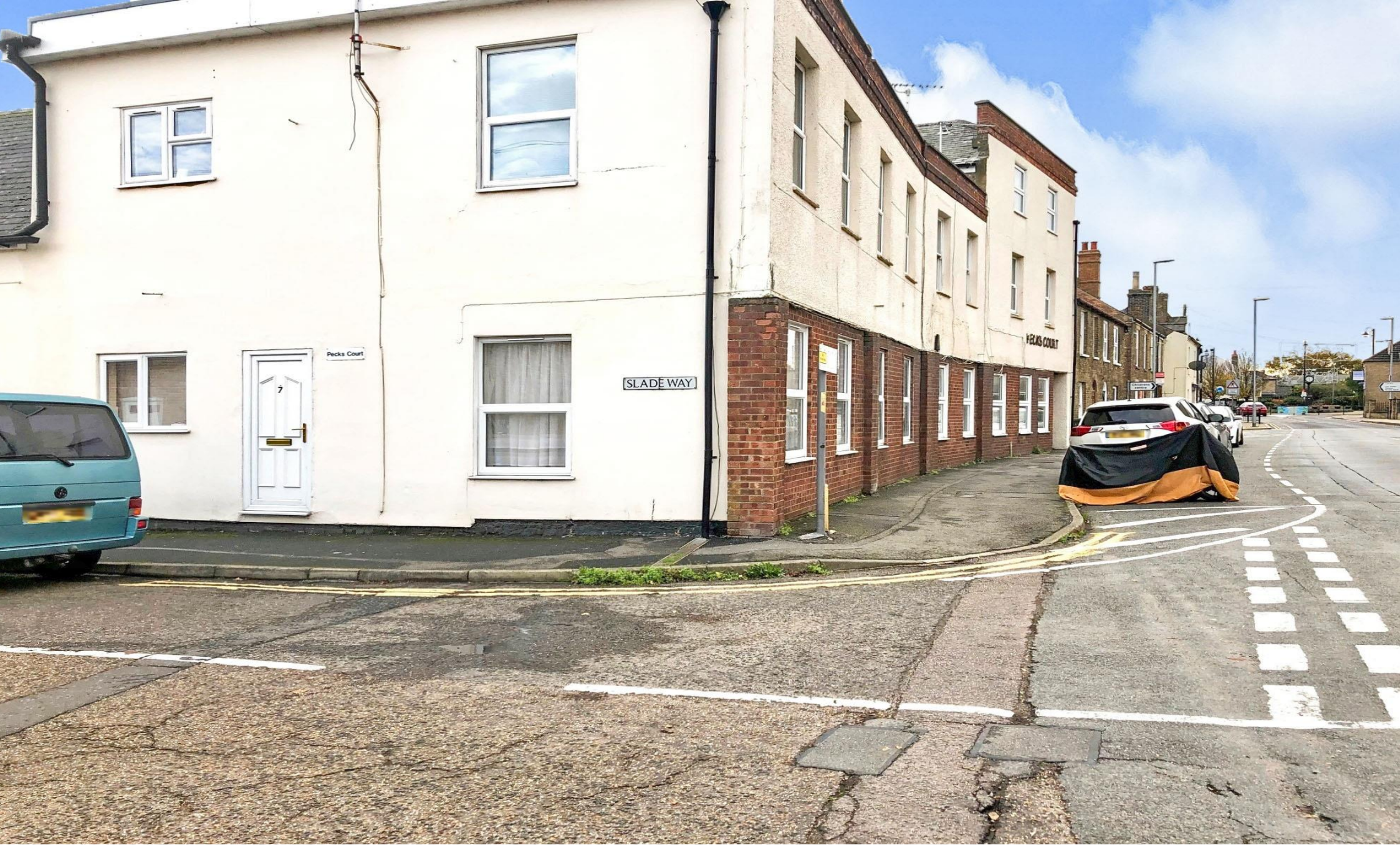
Pecks Court, Chatteris PE16 6NR