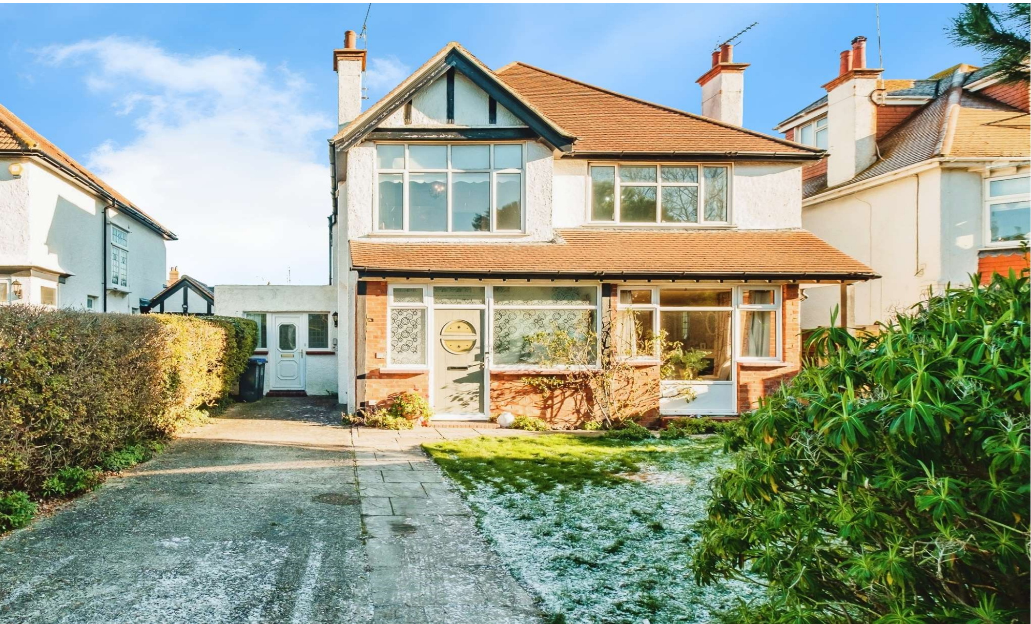
Grand Avenue, Worthing BN11 5AQ