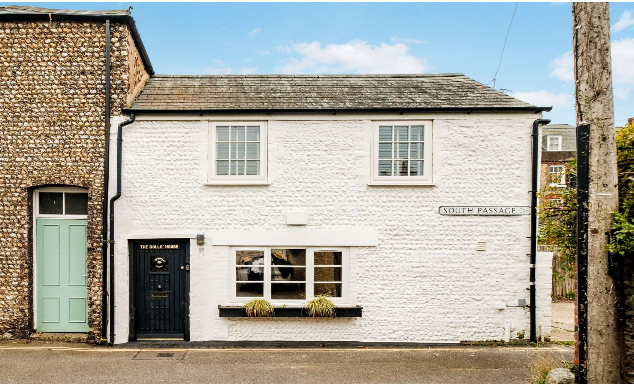
The Dolls House Norfolk Place, Littlehampton BN17 5PD