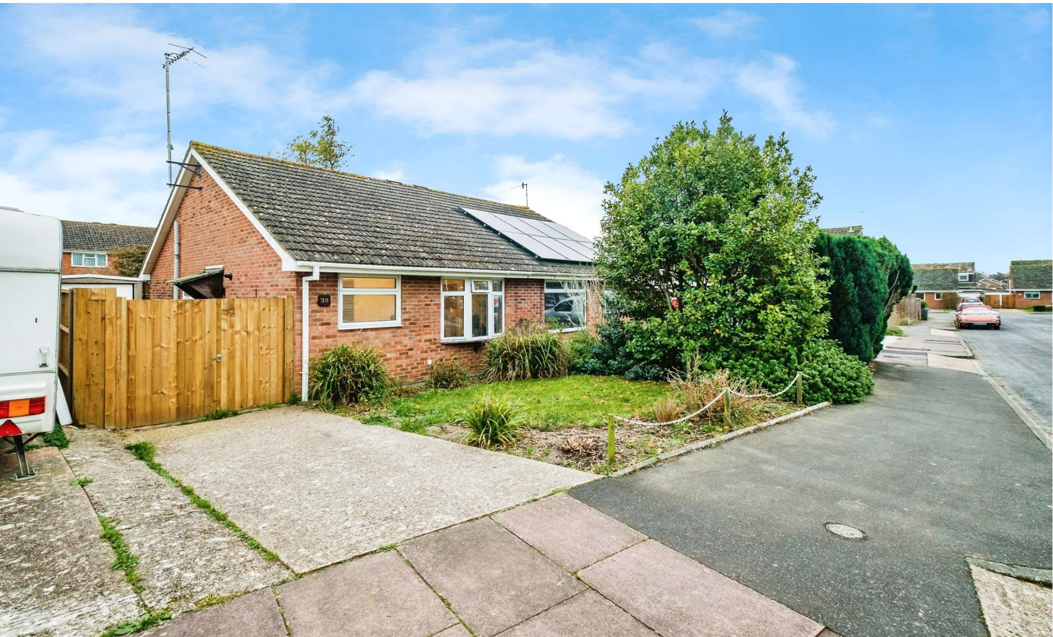
Halifax Drive, Worthing BN13 2TL