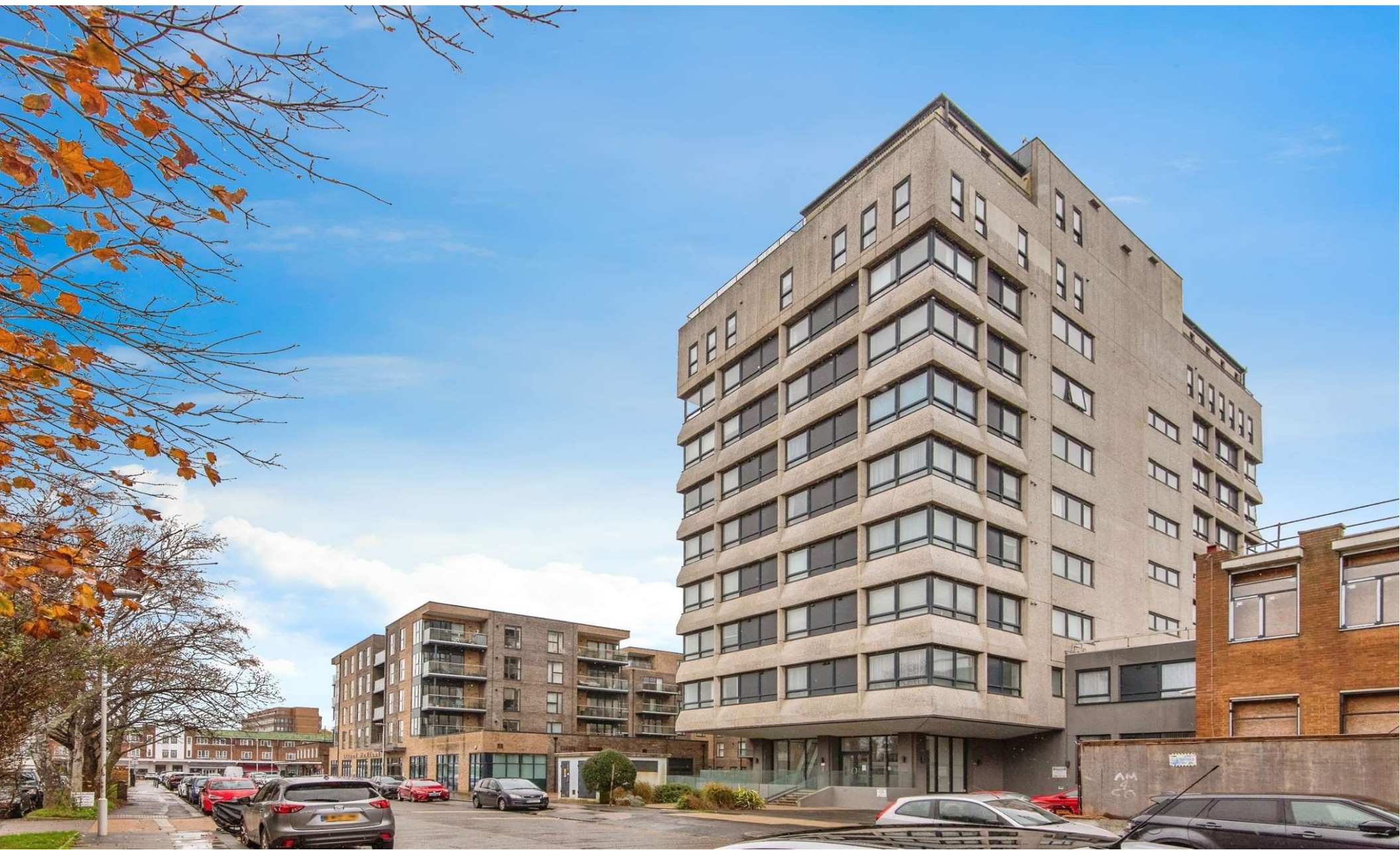
Skyline Apartments The Causeway, Goring-by-Sea WORTHING BN12 6FA