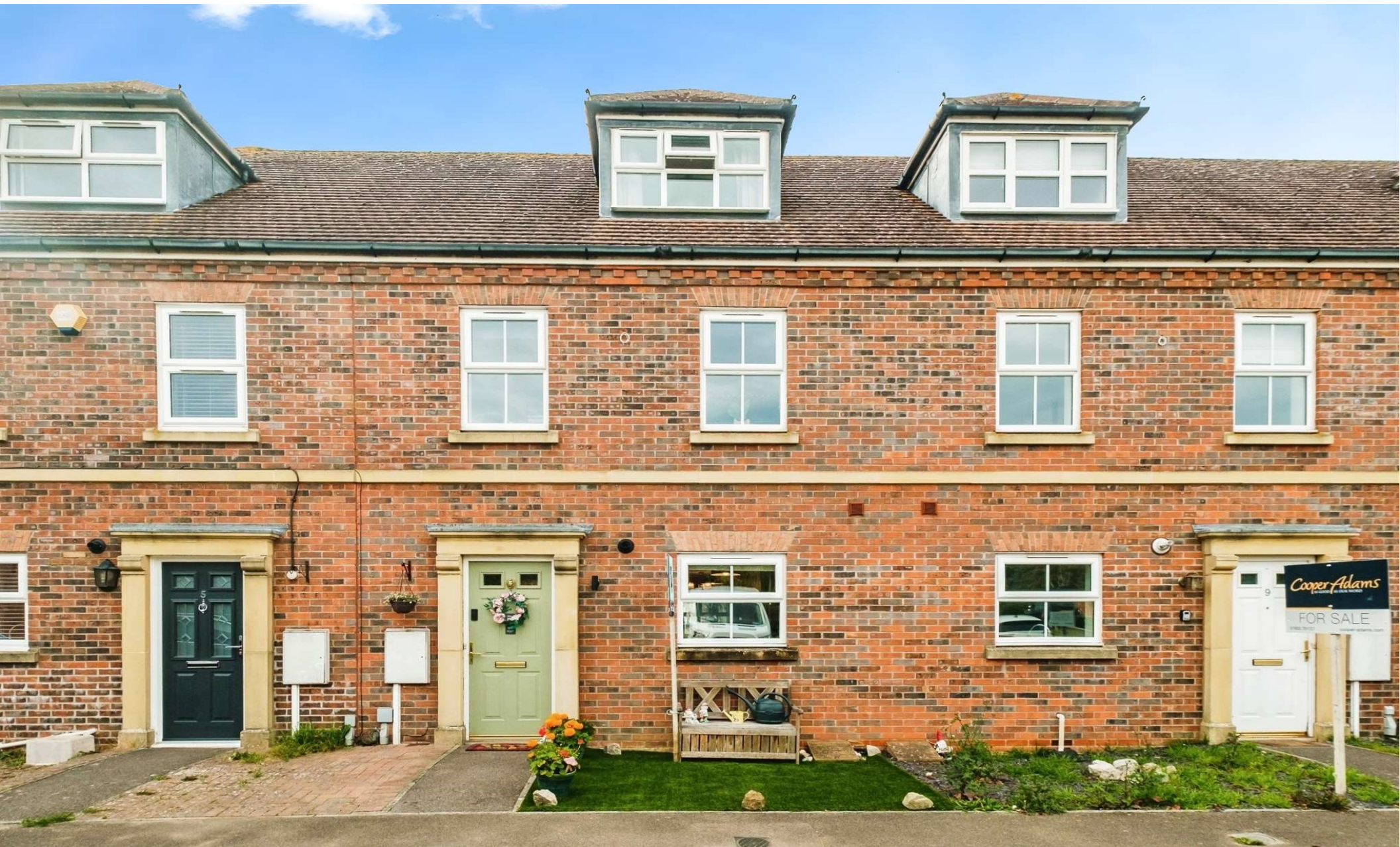
Highdown Close, Angmering Littlehampton BN16 4GT