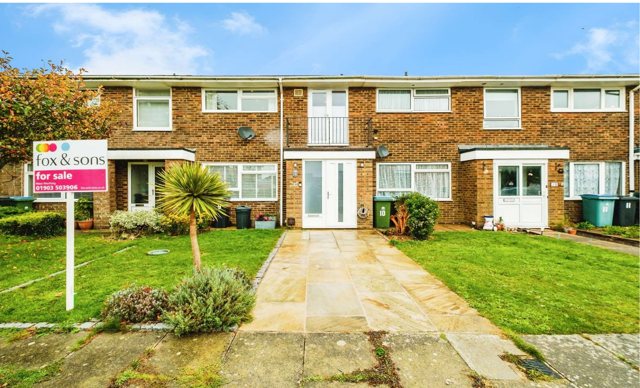
Ashton Gardens, Rustington Littlehampton BN16 2SH