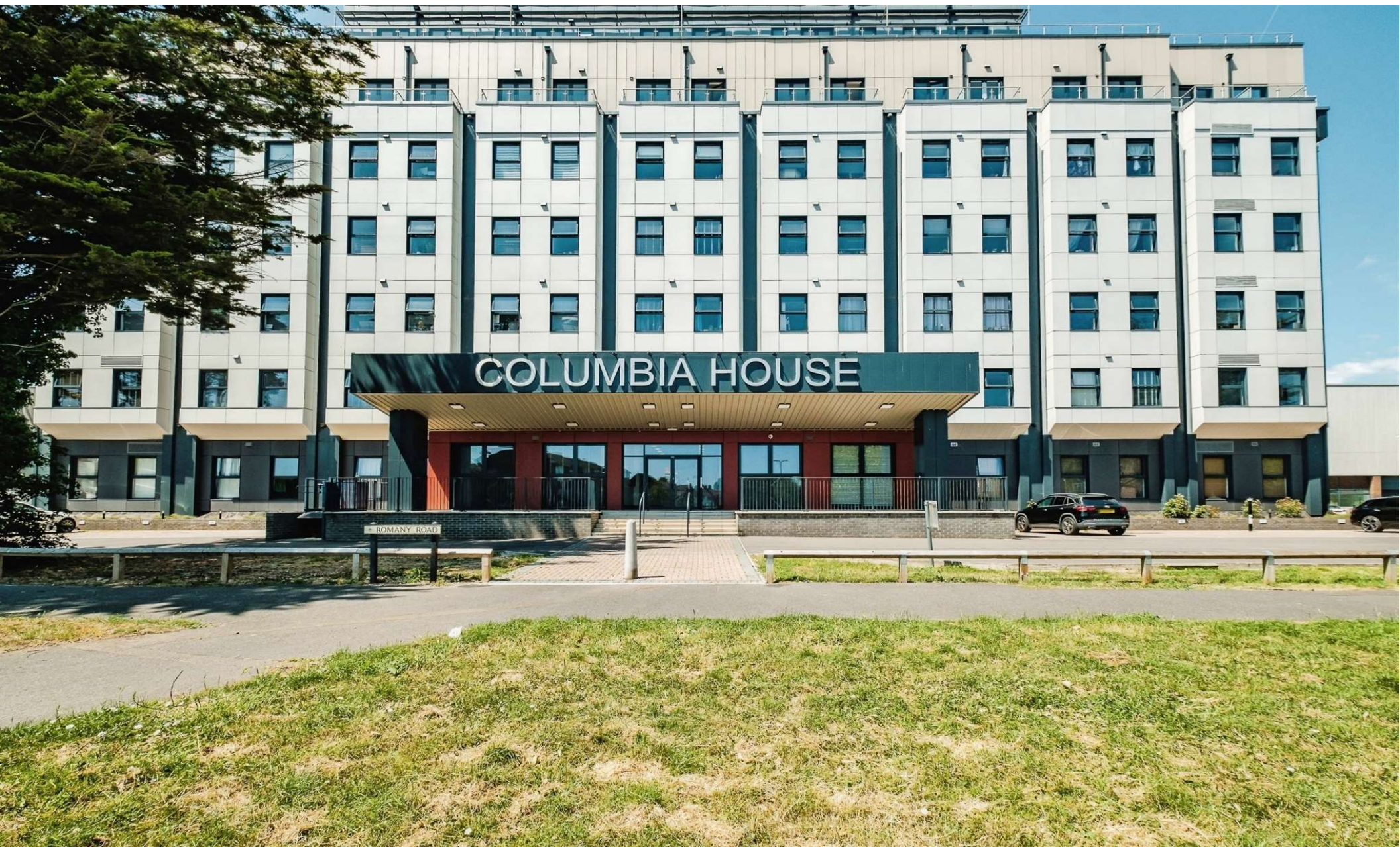
Columbia House Romany Road, Worthing BN13 3YS