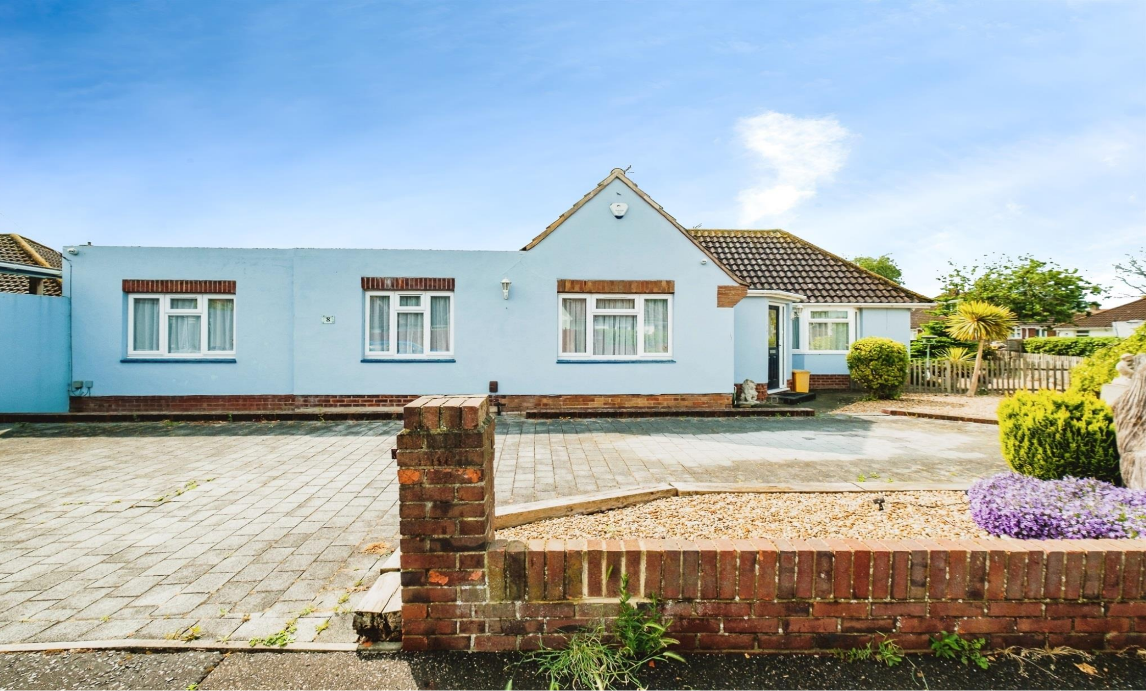
Muirfield Close, Worthing BN13 2LZ