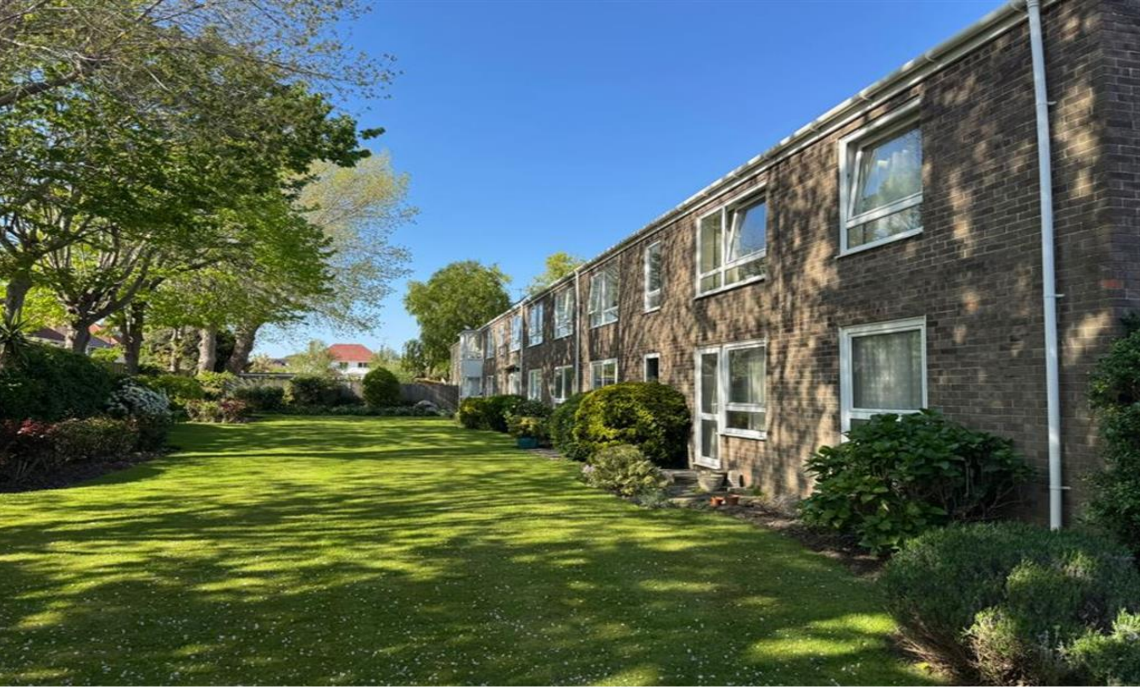
Norwich Court, Pevensey Garden, Worthing, BN11 5PG