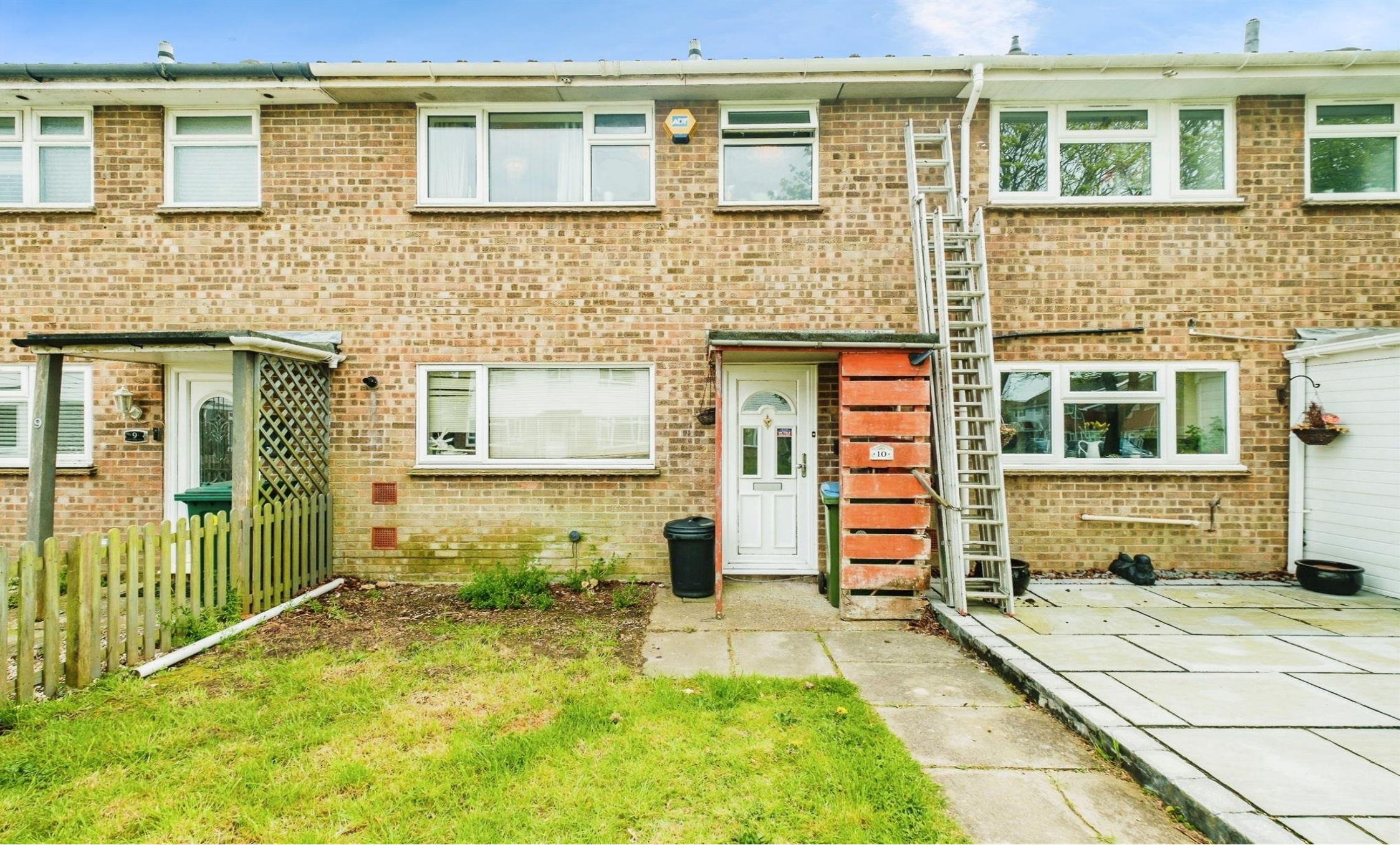
Fletcher Way, Angmering, Littlehampton, BN16 4HG