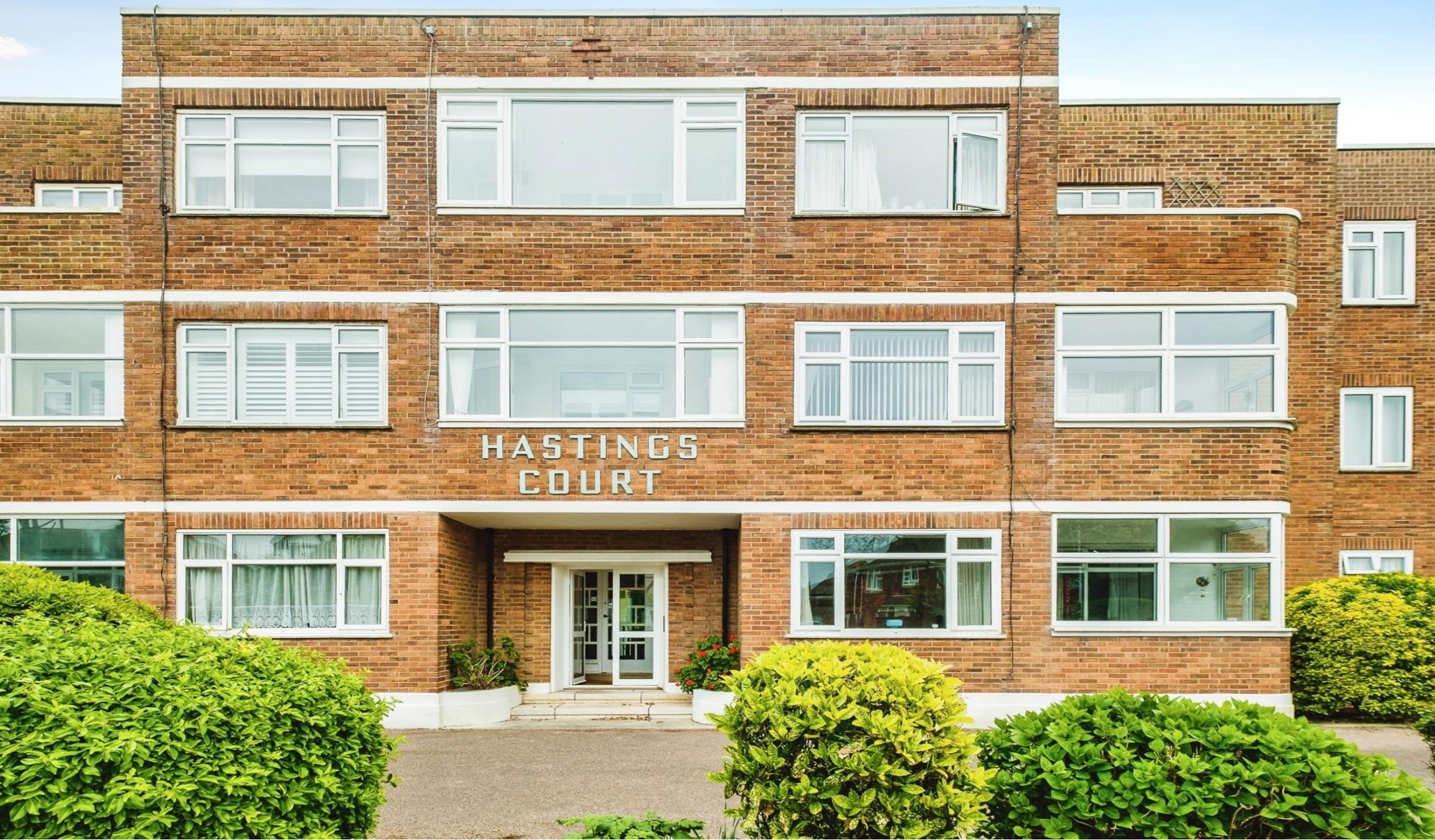
Hastings Court Winchelsea Gardens, Worthing BN11 5DD