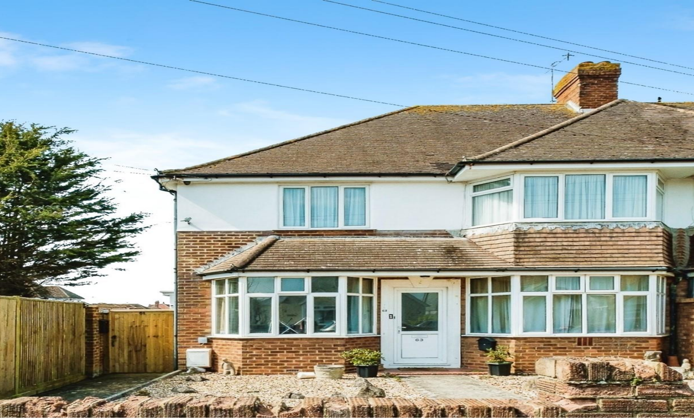
Sea Place, Goring-By-Sea Worthing BN12 4BS