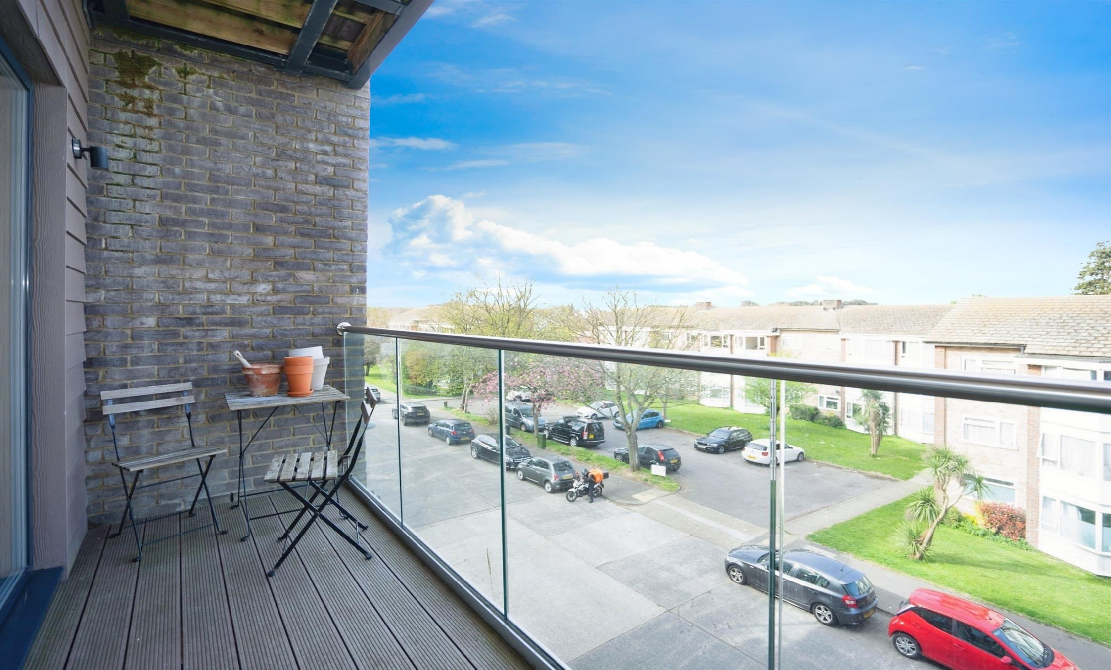
Causeway Place The Causeway, Goring-by-Sea WORTHING BN12 6FP