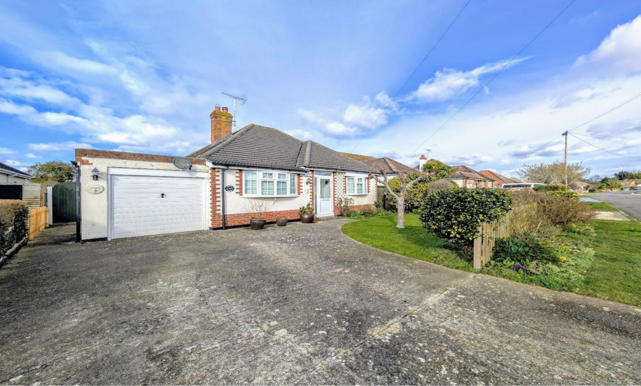
Cissbury Road, Ferring Worthing BN12 6QJ