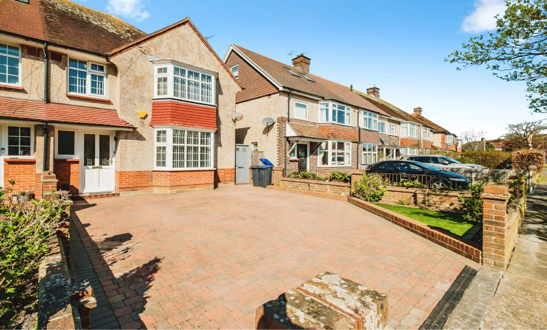
Pelham Road, Worthing BN13 1JA