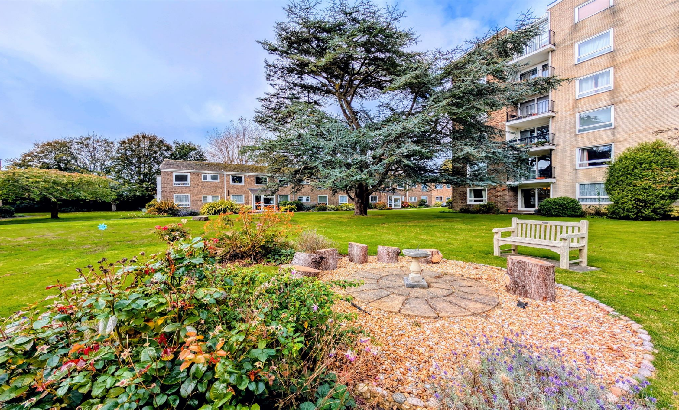
Norwich Court Pevensey Garden, Worthing BN11 5PG