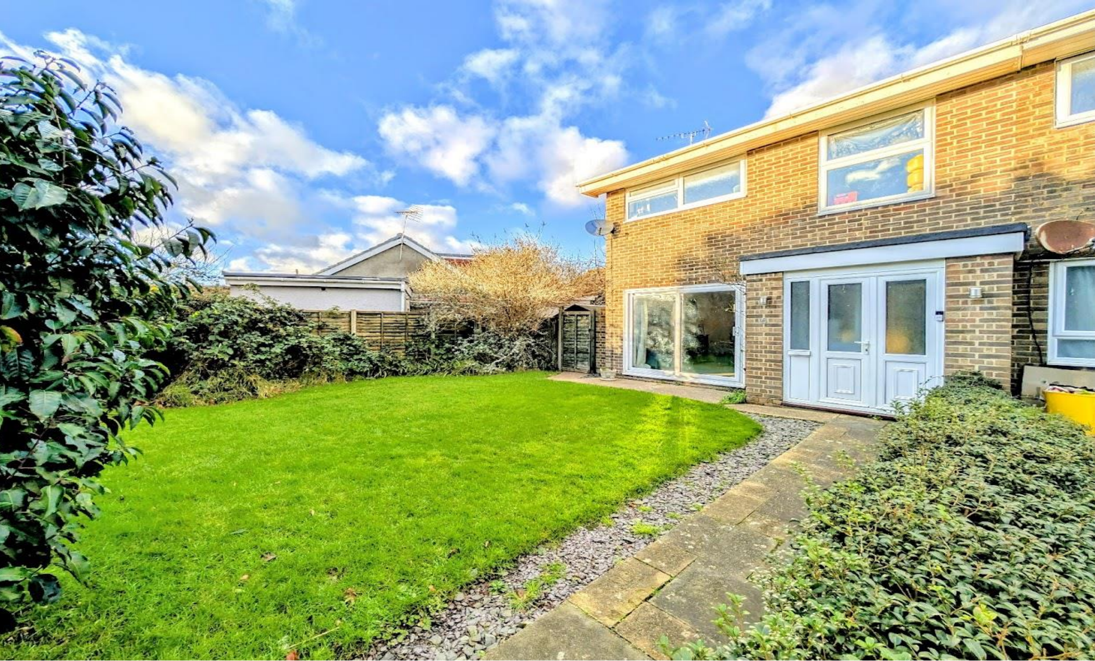
Ashton Gardens, Rustington Littlehampton BN16 2SH