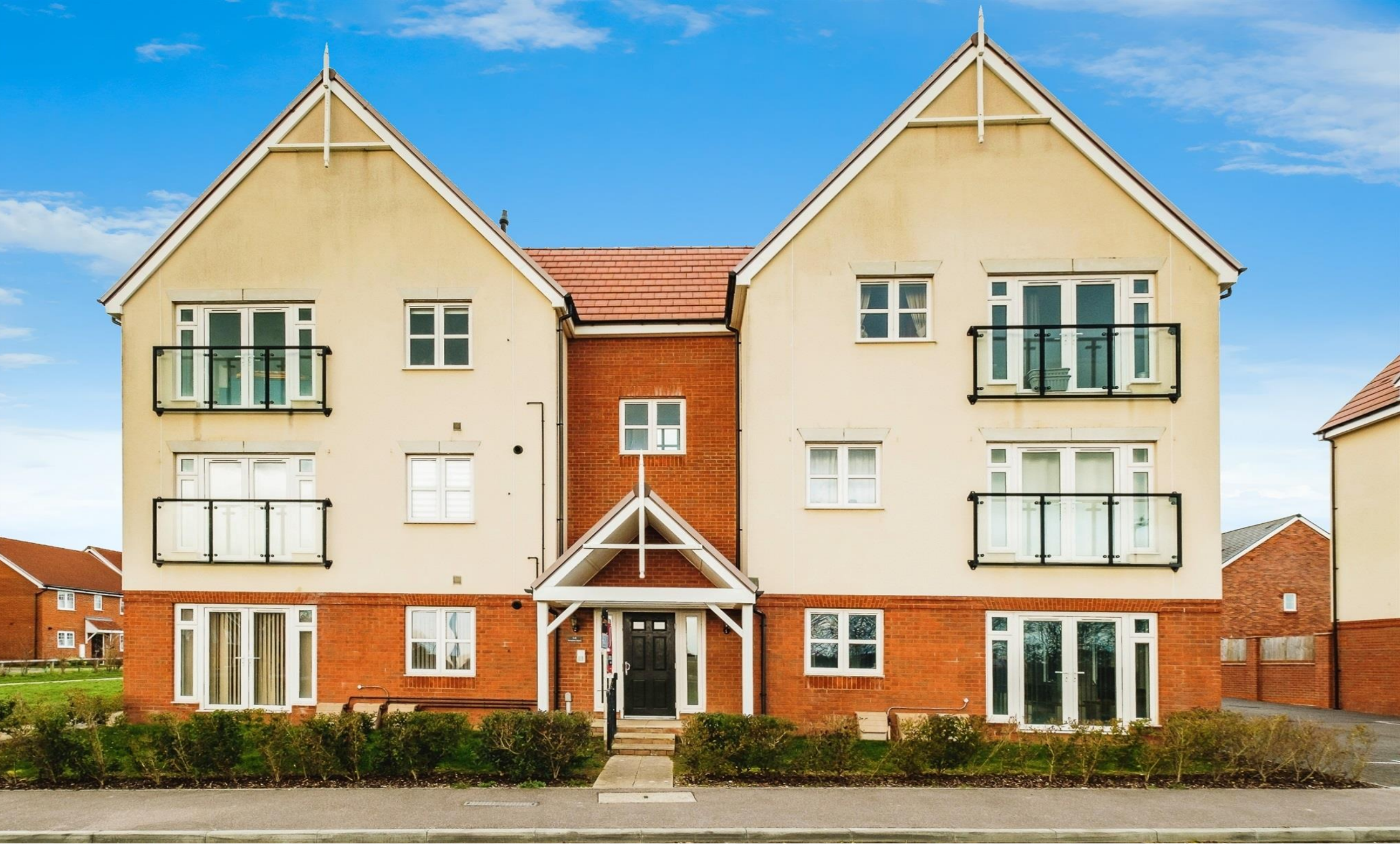
Ramsons House Snapdragon Lane, Worthing BN13 3GJ