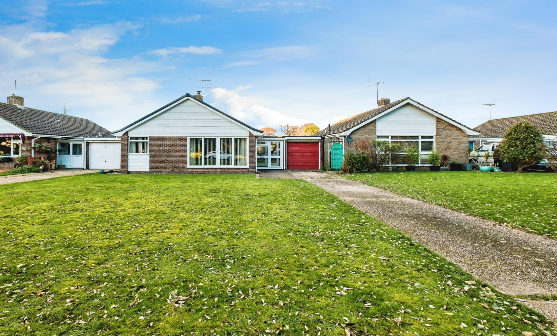
Fernhurst Drive, Goring-By-Sea Worthing BN12 5AU