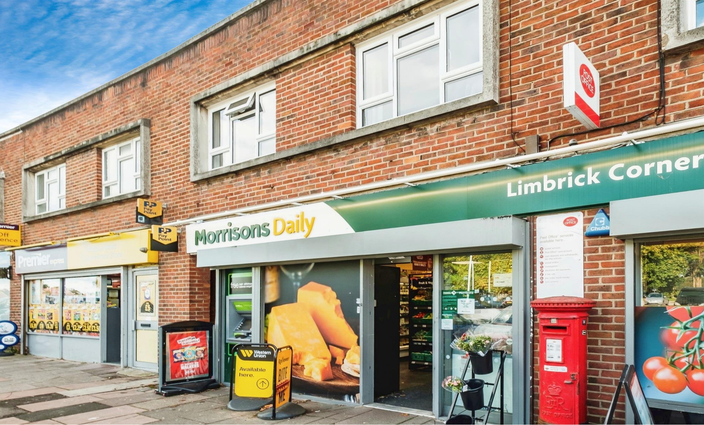
Limbrick Corner, Goring-By-Sea Worthing BN12 6JJ