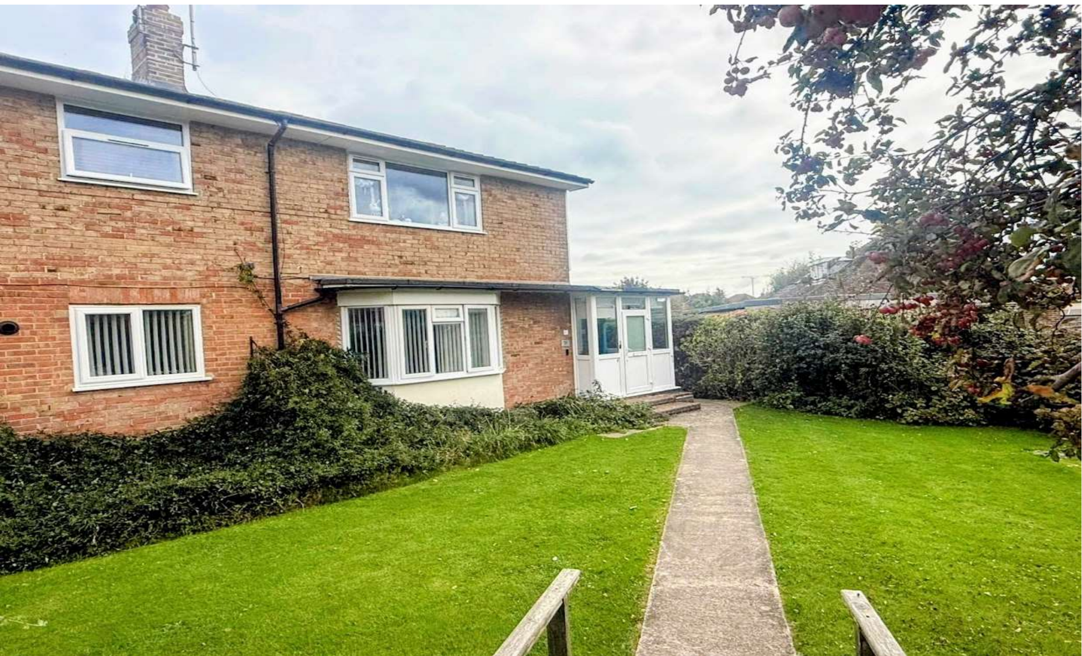
Chesham Close, Goring-By-Sea Worthing BN12 4BJ