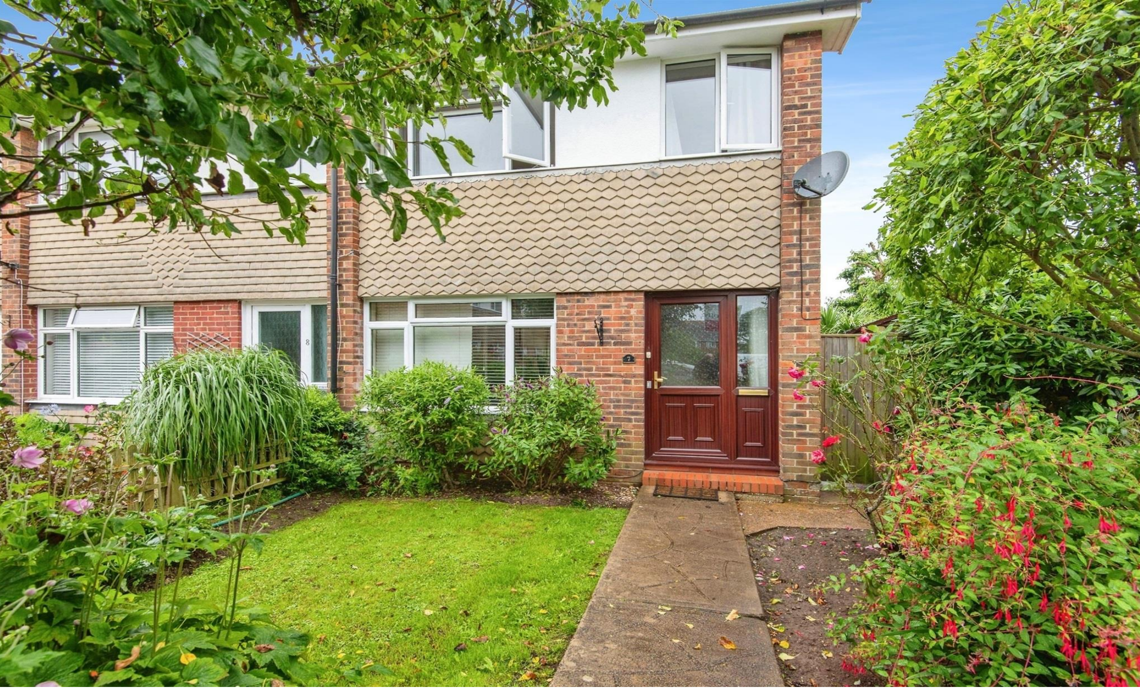
Barn Close, Worthing BN13 2BE