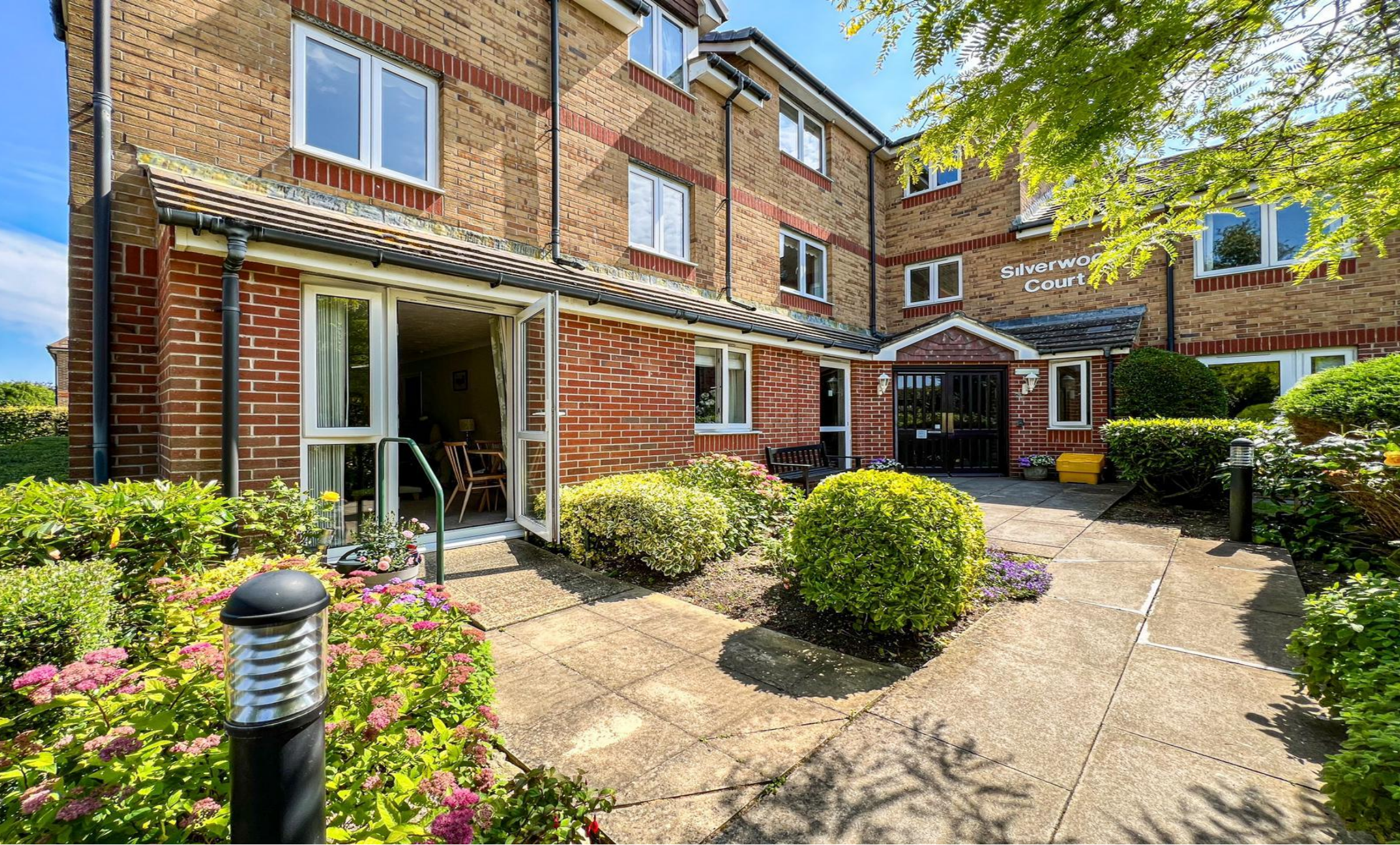
Silverwood Court Wakehurst Place, Rustington, BN16 3UZ