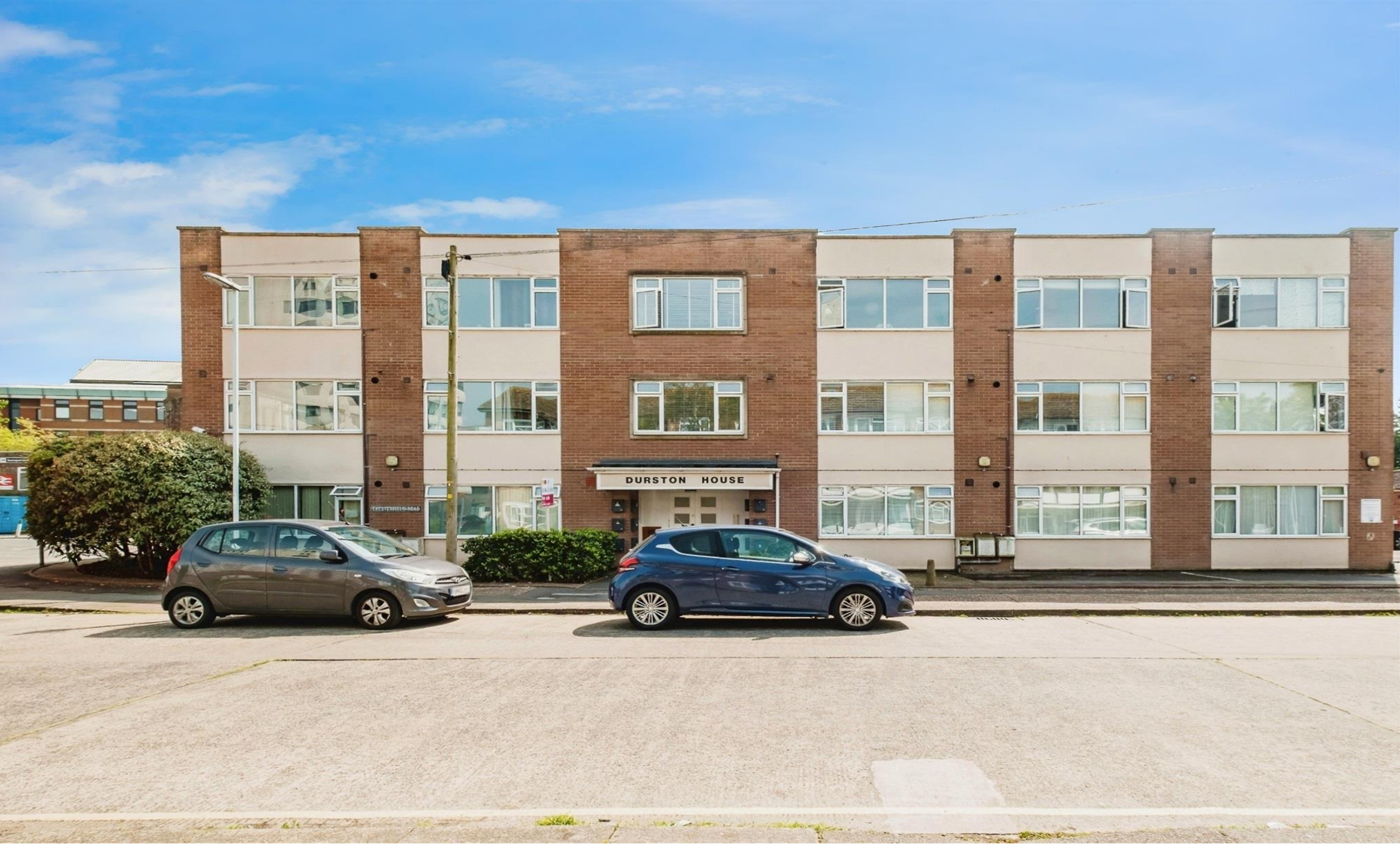
Durston House Chesterfield Road, Goring-by-Sea Worthing BN12 6BY