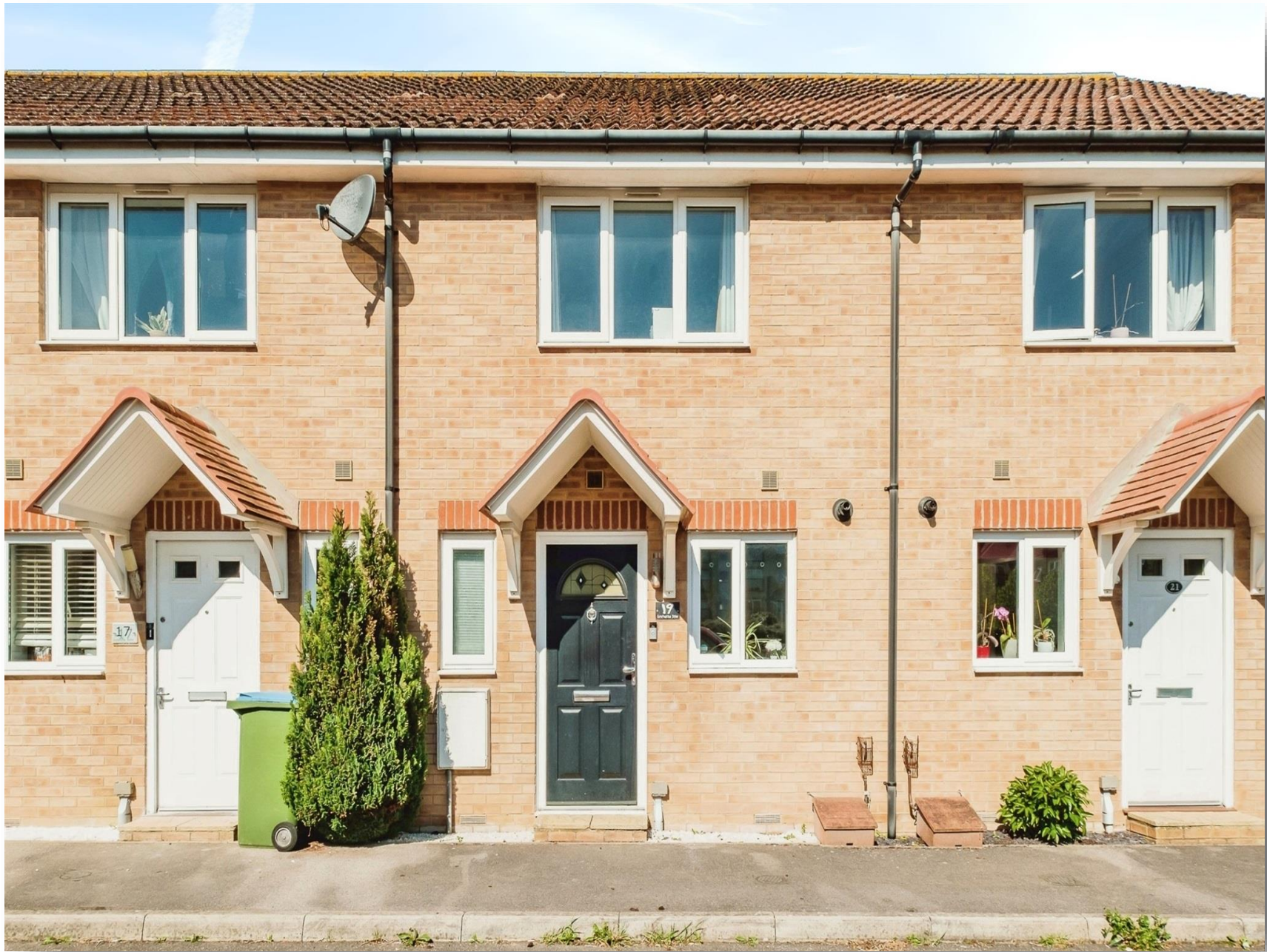
Gratwicke Drive, Wick Littlehampton BN17 6GU