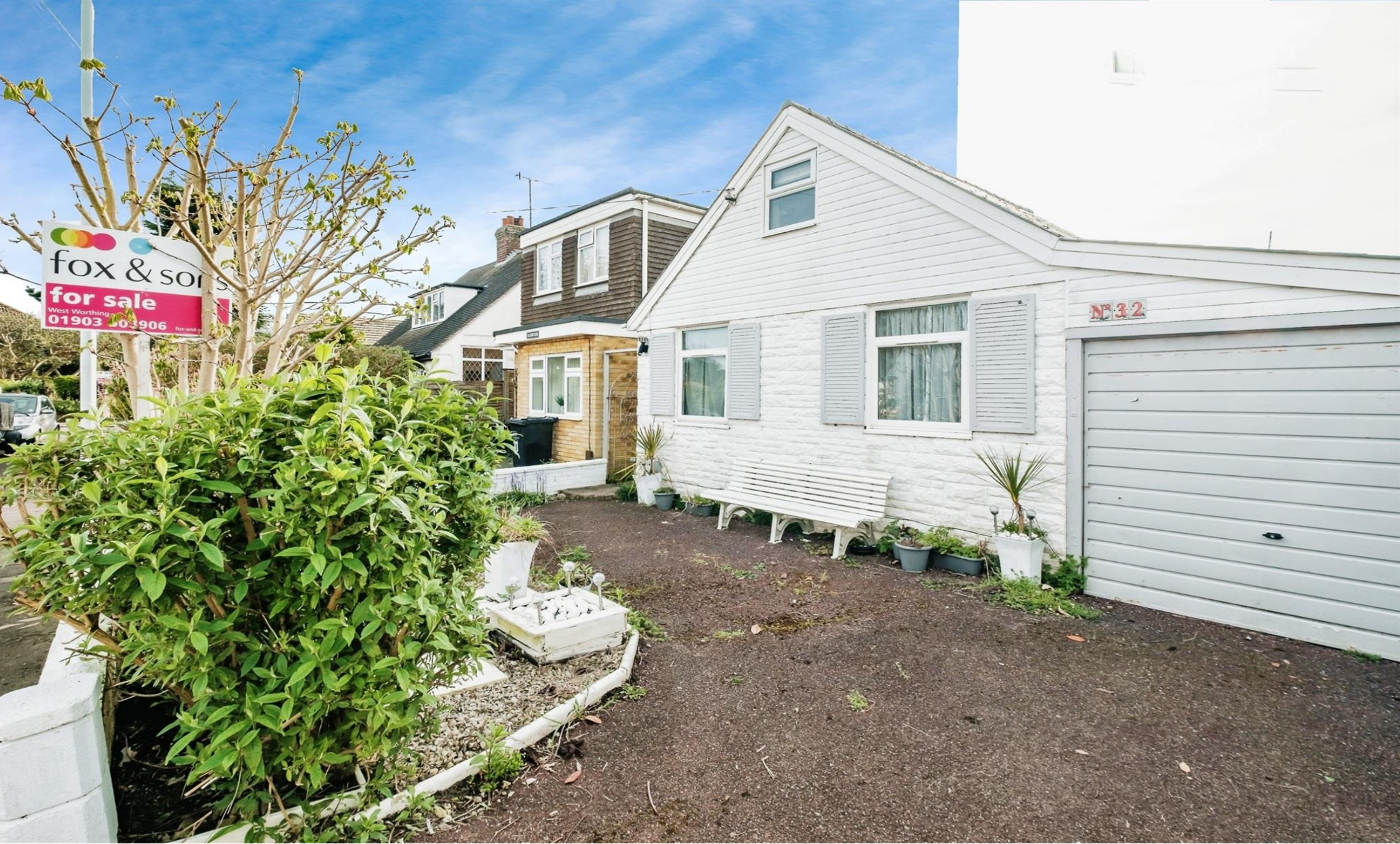
Courtlands Close, Goring-By-Sea Worthing BN12 4BT